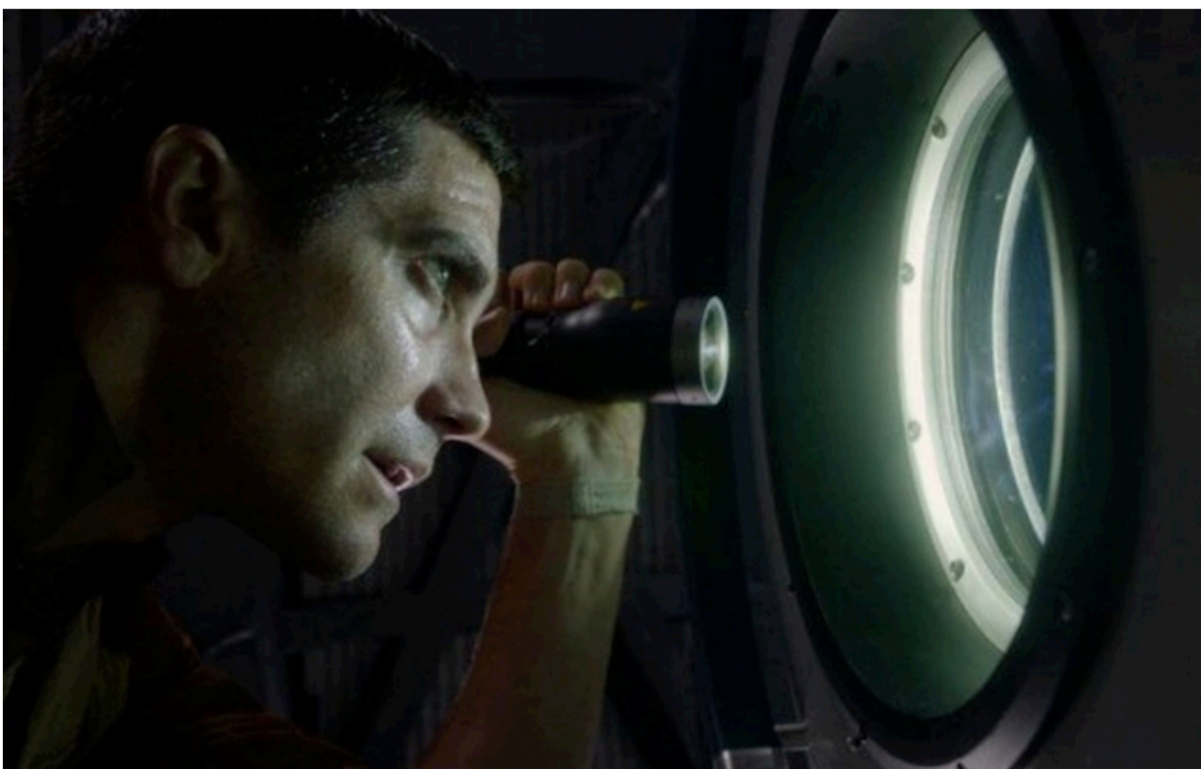
Jake Gyllenhaal Peers into Space in 'Life'