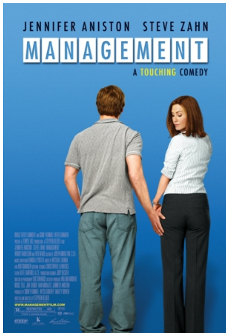
Management

"I remember sitting with a crowd at Sundance watching it and realizing that there is a thirst, at least in certain small crowds, for dialogue on-screen and that you can make it cinematic and interesting and dramatic. I always go back to that when I feel a scene is getting too long on a page."