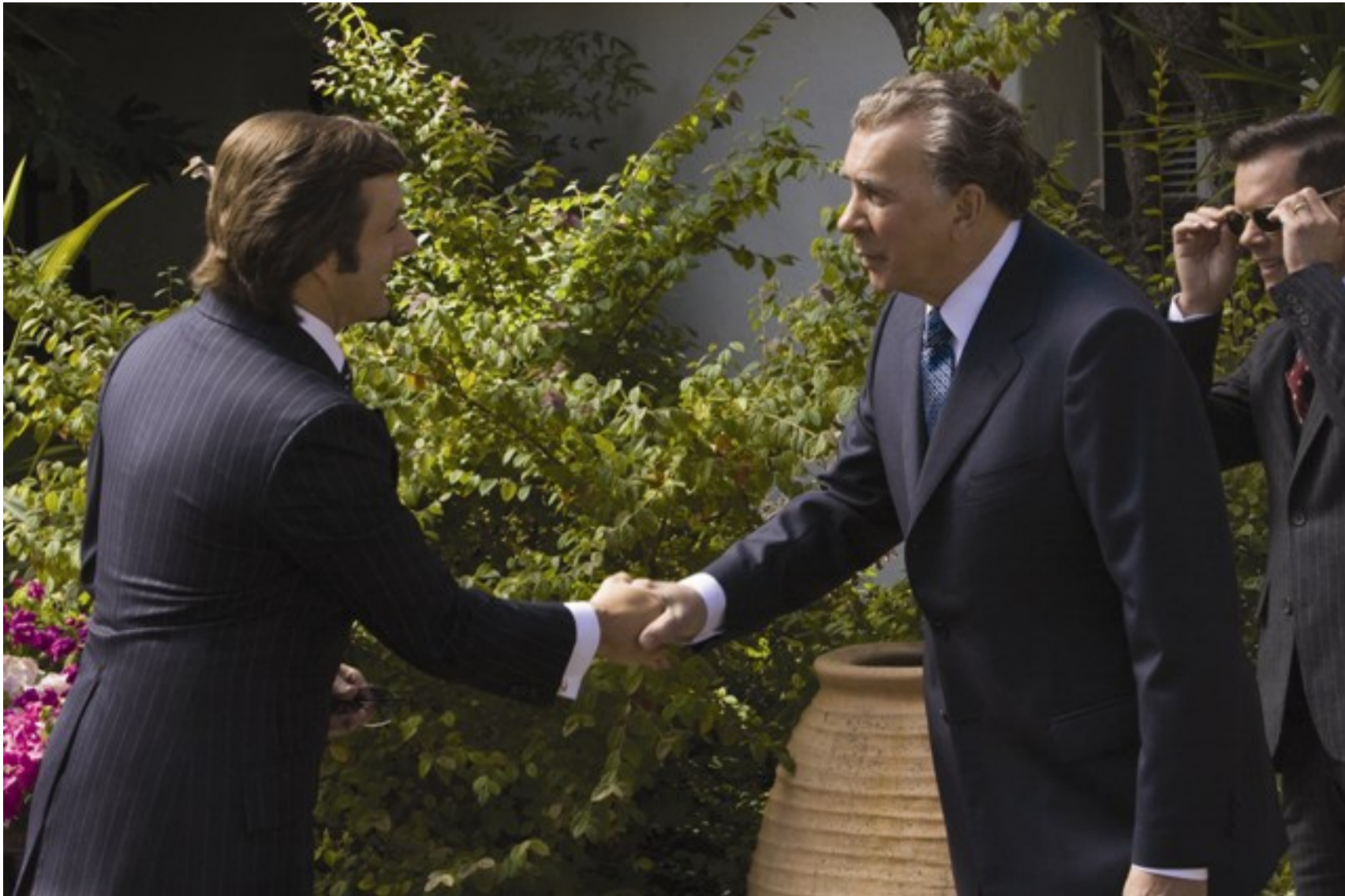
David Frost (Michael Sheen) greets Richard Nixon (Frank Langella) and Colonel Jack Brennan (Kevin Bacon) in "Frost/Nixon", from director Ron Howard.