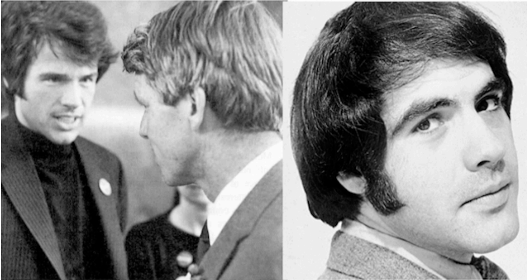
Witnesses in Chicago: Warren Beatty (left, with Robert F. Kennedy) and Robert Klein, circa 1968