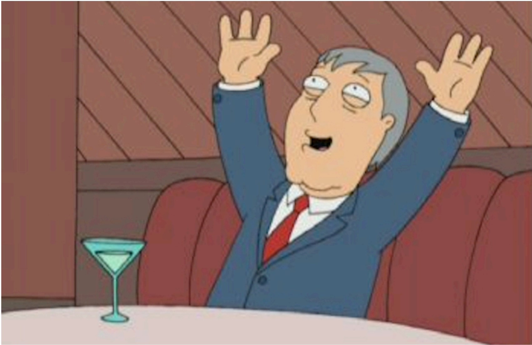
Lucky to Be Mayor Adam West in 'Family Guy'