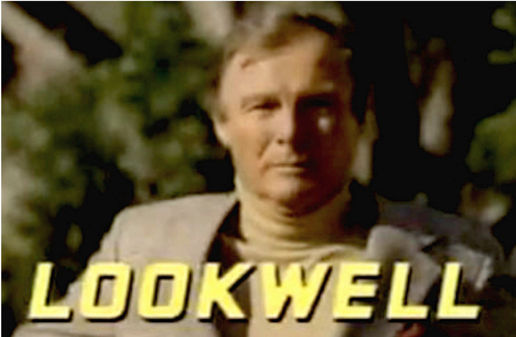
Adam West as Ty Lookwell in 1991