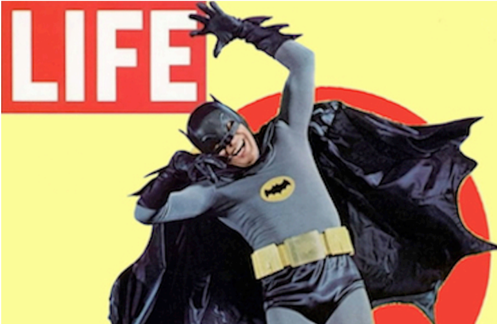
The LIFE of Adam West as Batman in 1966

It's almost impossible to describe the anticipation of a five year-old waiting for the "Batman" TV series to begin in January of 1966. I was that boy. I can picture the scene now, over 50 years ago (Jeebus, Gramps!), the whole neighborhood gathered around the ONLY color TV set in the hood, at the Baldwin's residence on Willow Court in Michigan City, Indiana. (not Alec). I can also picture the weirdness of the episode, and I know that memory is sound because I've since watched it ("Hi Diddle Riddle"). The series was two-times-a-week-consecutive-days appointment television – they broke the format mold – and was incredibly exciting as a mid-1960s zeitgeist. I have never not loved the show, and I have never not loved the great Adam West as a concept. He lived and breathed the bizarre nature of both the hero and the jester in that series, and never broke the seriousness of his portrayal of the Caped Crusader. He was, and ever will be as the Bat, "All Pure West."