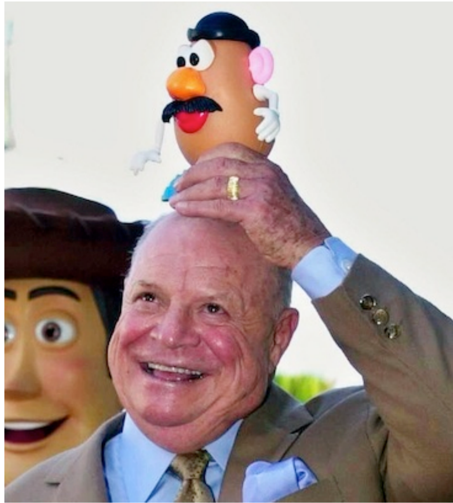
Mr. Potato Head of 'Toy Story'

But his main stage would always be his stand-up insult comic act, played to perfection on "The Tonight Show Starring Johnny Carson," where he first appeared in 1965. He became one of Johnny Carson's favorite guests, and his appearances took on the stuff of legends. He also often guest hosted on the show, and in one of the most memorable moments broke Carson's prized cigarette box. When Johnny returned and noticed, he took a camera onto the set of Rickles' sitcom at the time, "CPO Sharkey." The hilariously organic clip was repeated several times on "The Tonight Show" anniversary specials.