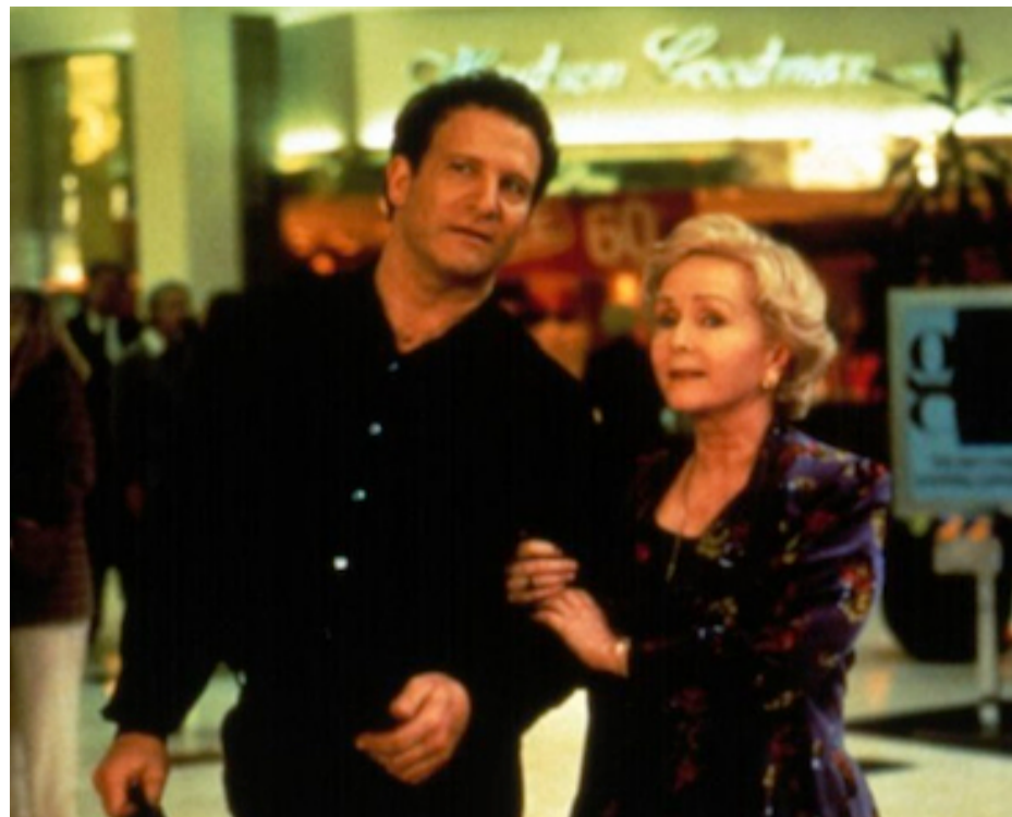
With Albert Brooks in 'Mother' (1996)