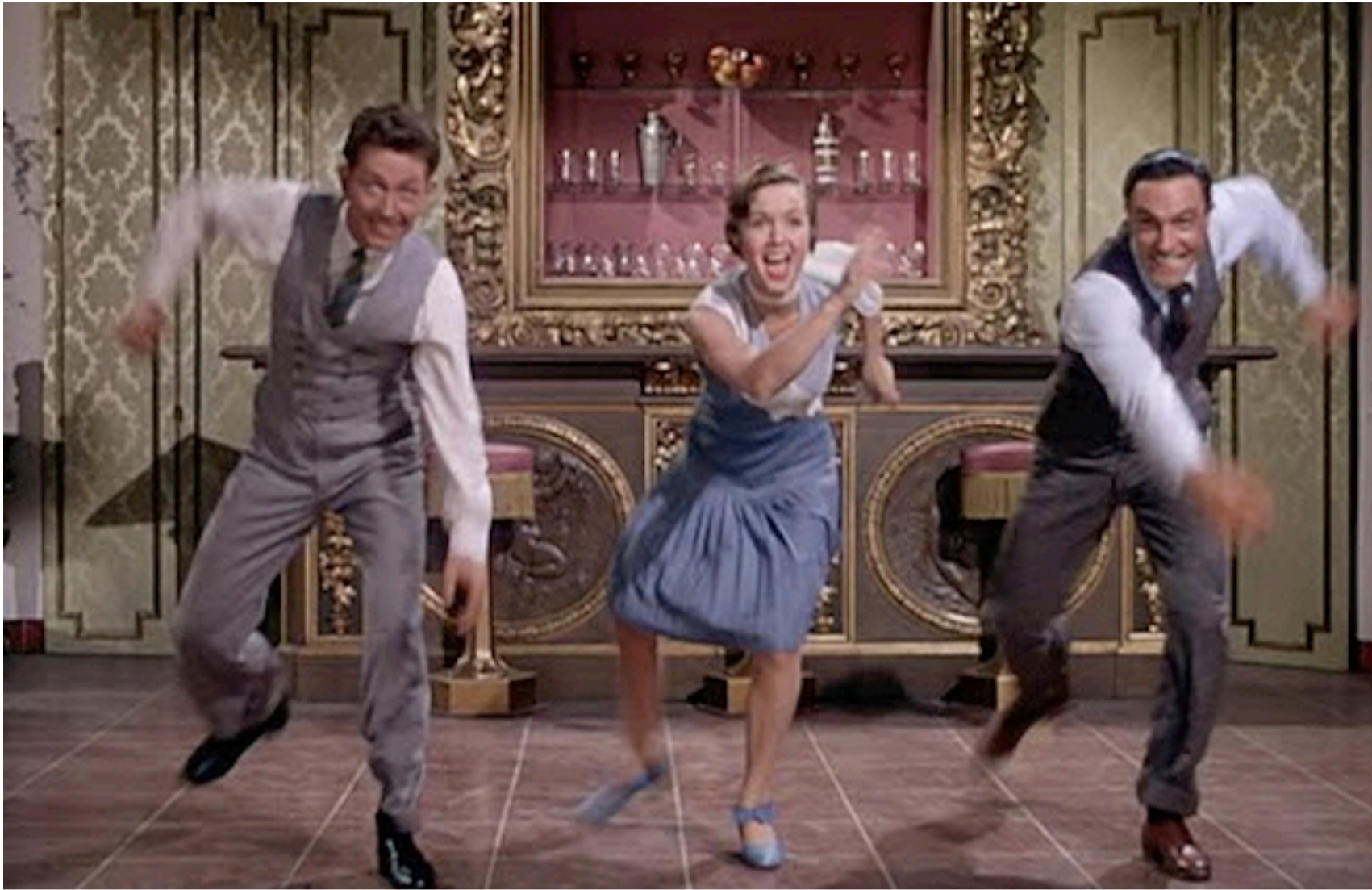
Debbie Reynolds Hoofs it Up with Donald O'Connor (left) and Gene Kelly in 'Singin' in the Rain'

HollywoodChicago.com: You were put into the spotlight at a very early age. Was that a natural place for you to be or did it take awhile for you to catch up with it?