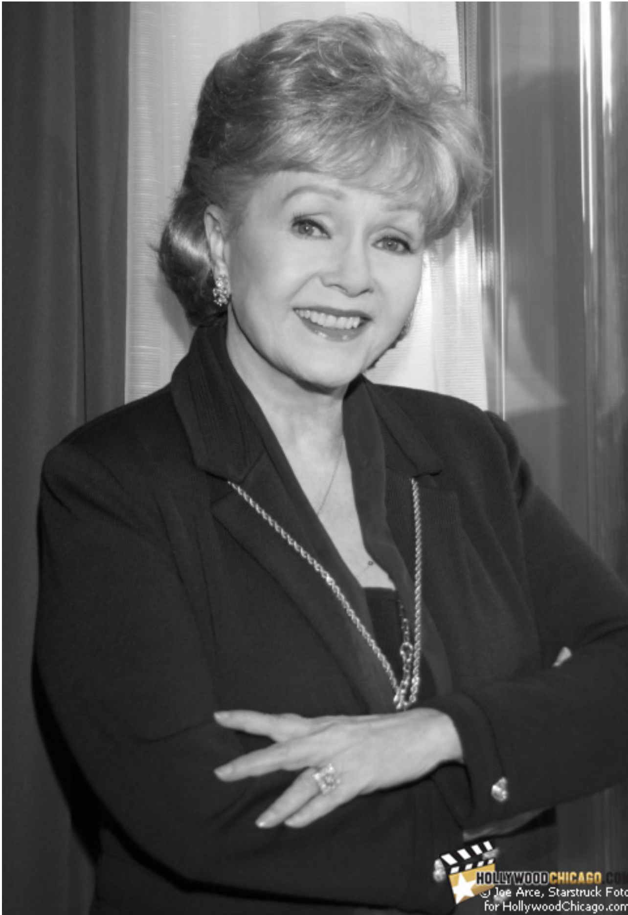
Debbie Reynolds in Chicago, 2009