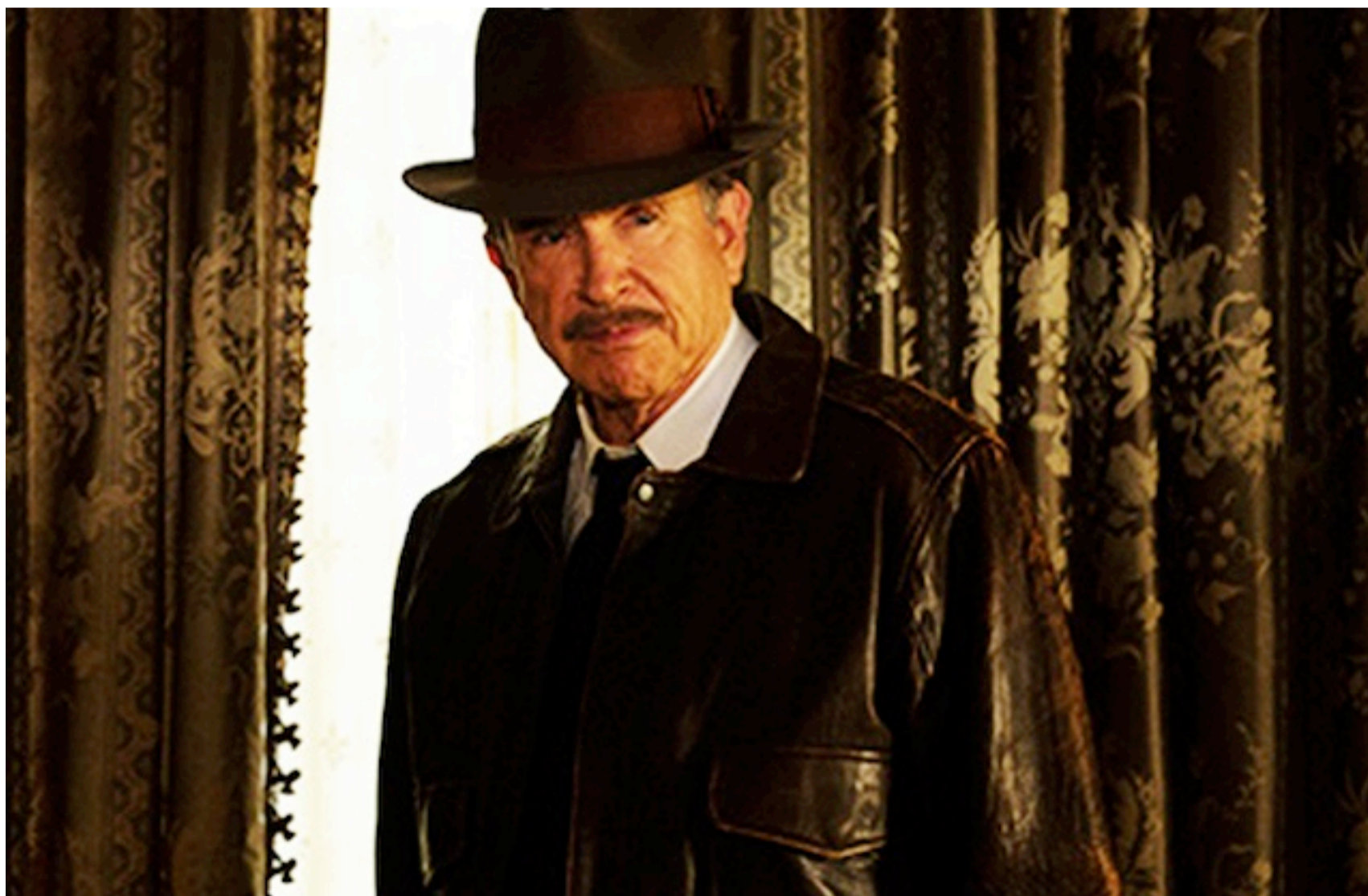
Warren Beatty as Howard Hughes in 'Rules Don't Apply'

The film is a quasi-biographical profile of the legendary American billionaire Howard Hughes, but don't mention that to writer/director Beatty (who also portrays Hughes). What he wanted to explore was the truth around Hughes, in the personification of a fictional couple (Alden Ehrenreich and Lily Collins) working for the billionaire. Set in 1958 Hollywood – the same year a young Warren Beatty arrived there – the film highlights the clash between the sexual looseness that existed in the movie business, and the potential seekers that “got off the bus” in tinsel town, still mired in their 1950s puritanism.