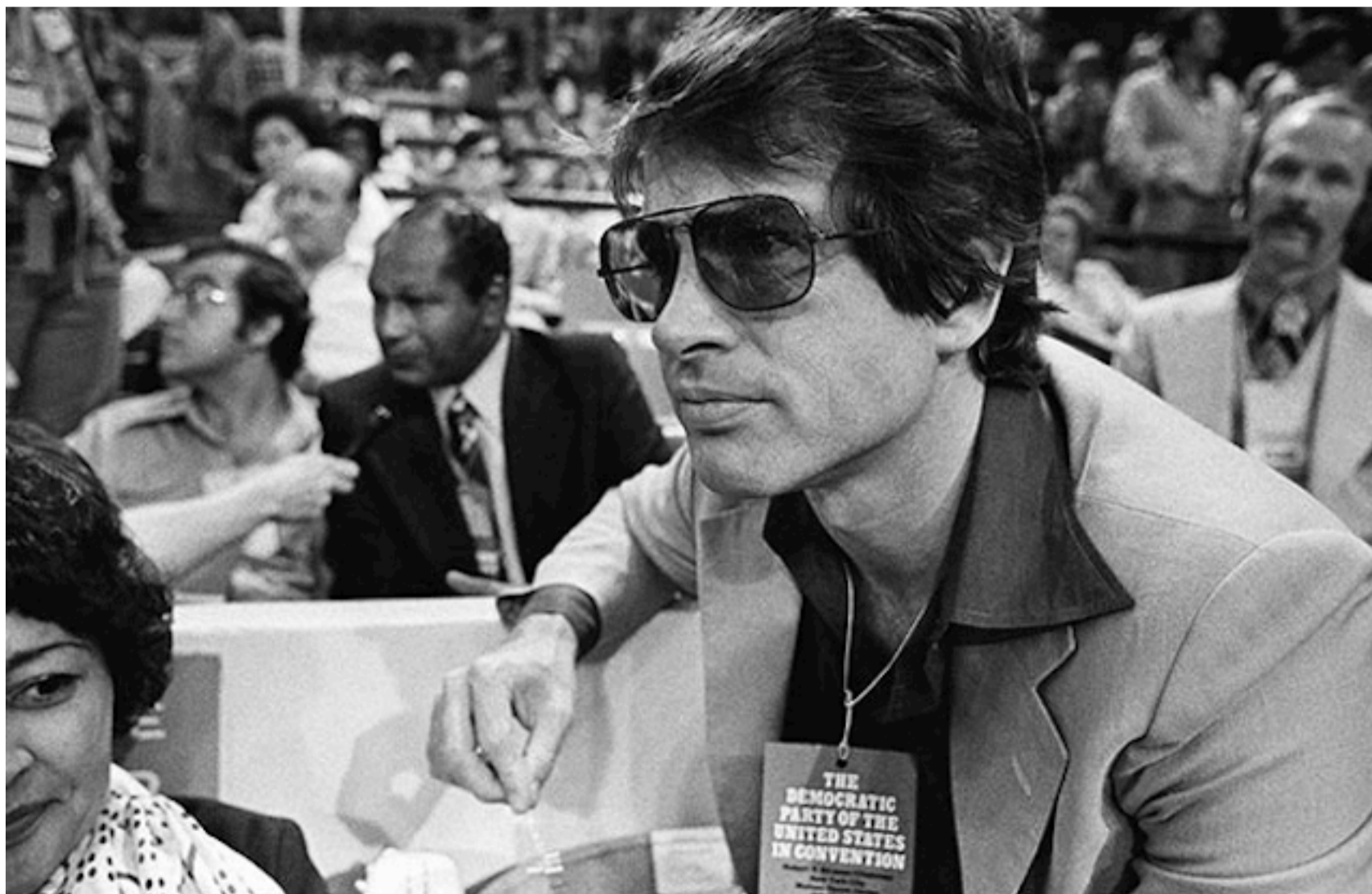
Warren Beatty at the 1976 Democratic National Convention

Beatty: Yes. I'm not being indiscreet, because Cliff Robertson did a great job, but I didn't want to do it. But in the process, I became friendly with Jack Kennedy, Pierre Salinger [Kennedy's Press Secretary] and Bobby Kennedy. I never got over those assassinations.