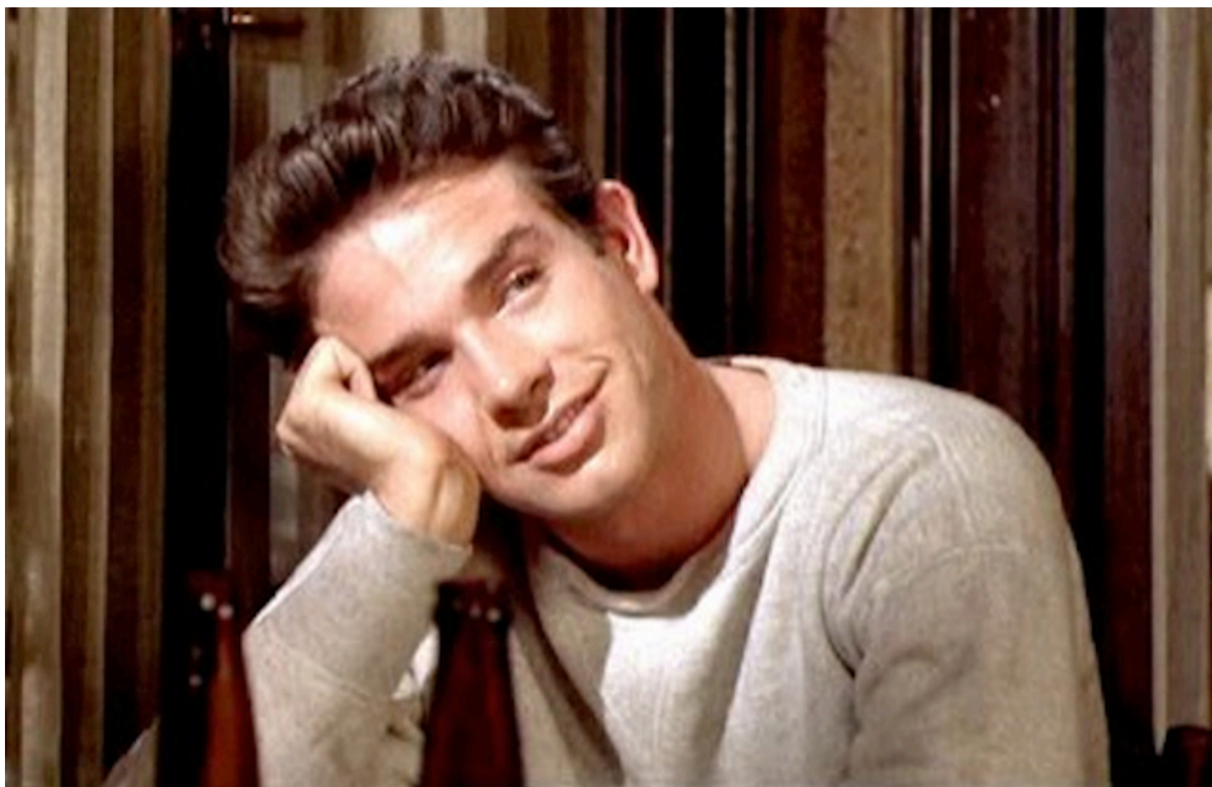
Welcome to Hollywood: Warren Beatty in 1961's 'Splendor in the Grass'

In the 1970s Warren Beatty continued on a path of ground-breaking films, including the Robert Altman directed "McCabe and Mrs. Miller" (1971), the conspiracy-oriented "The Parallax View" (1974) and the 1970s excess-defining "Shampoo" (1975). He made his directorial debut (with Buck Henry) on a remake of a studio-era film called "Heaven Can Wait" (1978). The success of that film set him up for his greatest triumph, as he produced, wrote, directed and starred in "Reds" (1981), portraying American reporter John Reed during the height of the Russian Revolution in 1917. It received 12 Academy Award nominations, and four for Beatty himself (Best Picture, Director, Actor and Original Screenplay). He won the Oscar for Best Director.