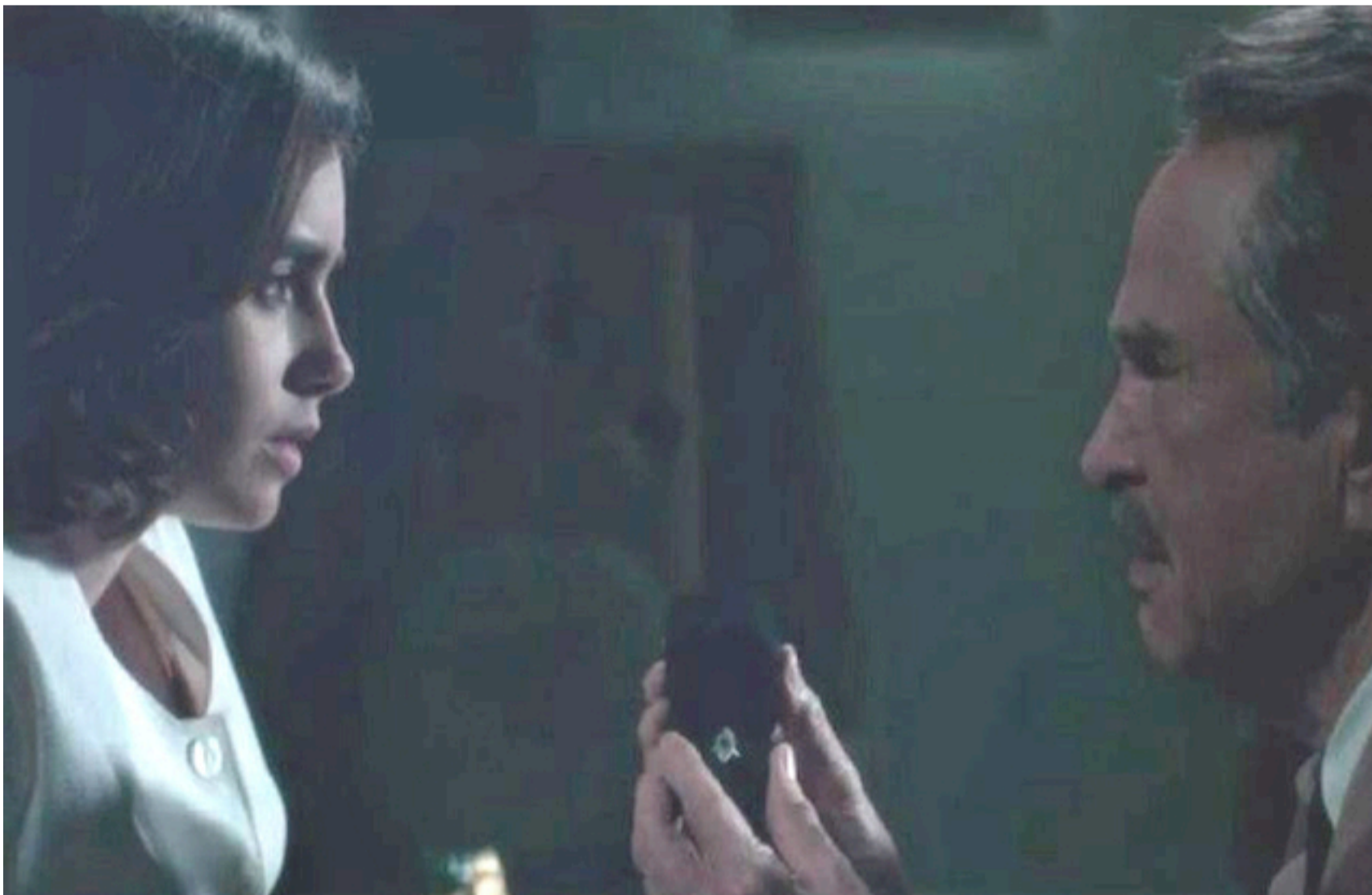
Lily Collins and Warren Beatty in 'Rules Don't Apply'

I said, 'Howard Hughes? You mean the person in the suite next door to me is Howard Hughes?' They told me that Mr. Hughes has seven suites, and five bungalows. Even then I thought that was grounds for a farce. I always held onto the comedic element of that, and put that into the film. In fact, everything that happens to Howard Hughes comes from stories that I have been told about him. They didn't happen in sequence in the film.