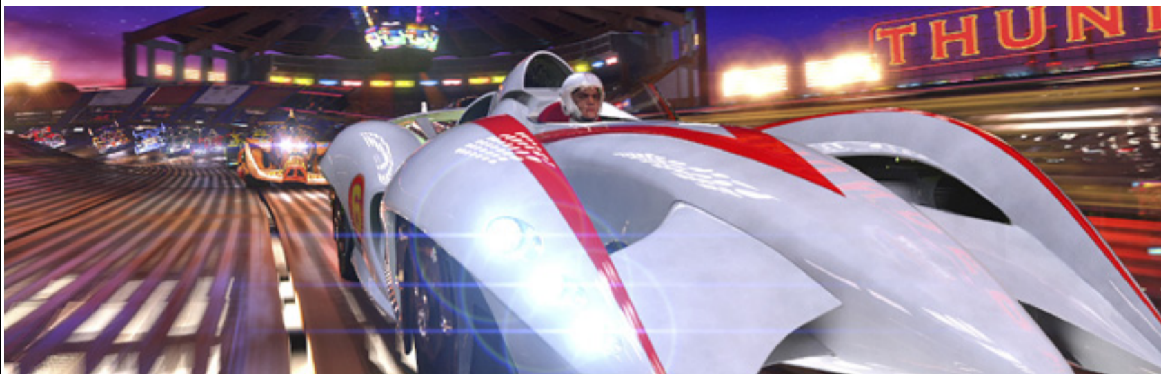
Emile Hirsch in "Speed Racer".

Just as "The Matrix" in 1999 had sequences that have been among the most emulated in Hollywood today over the past decade, the Wachowskis continue to up their own bar.