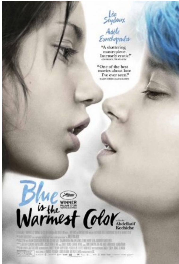
Blue is the Warmest Color