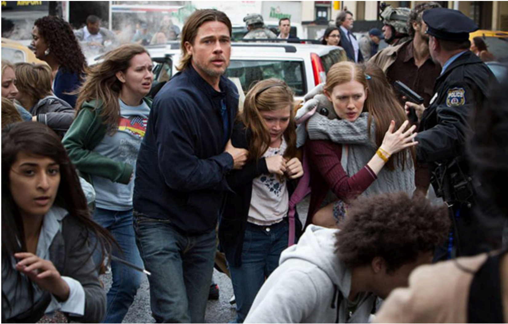
We Gotta Get Outta This Place: Brad Pitt and Family in 'World War Z'