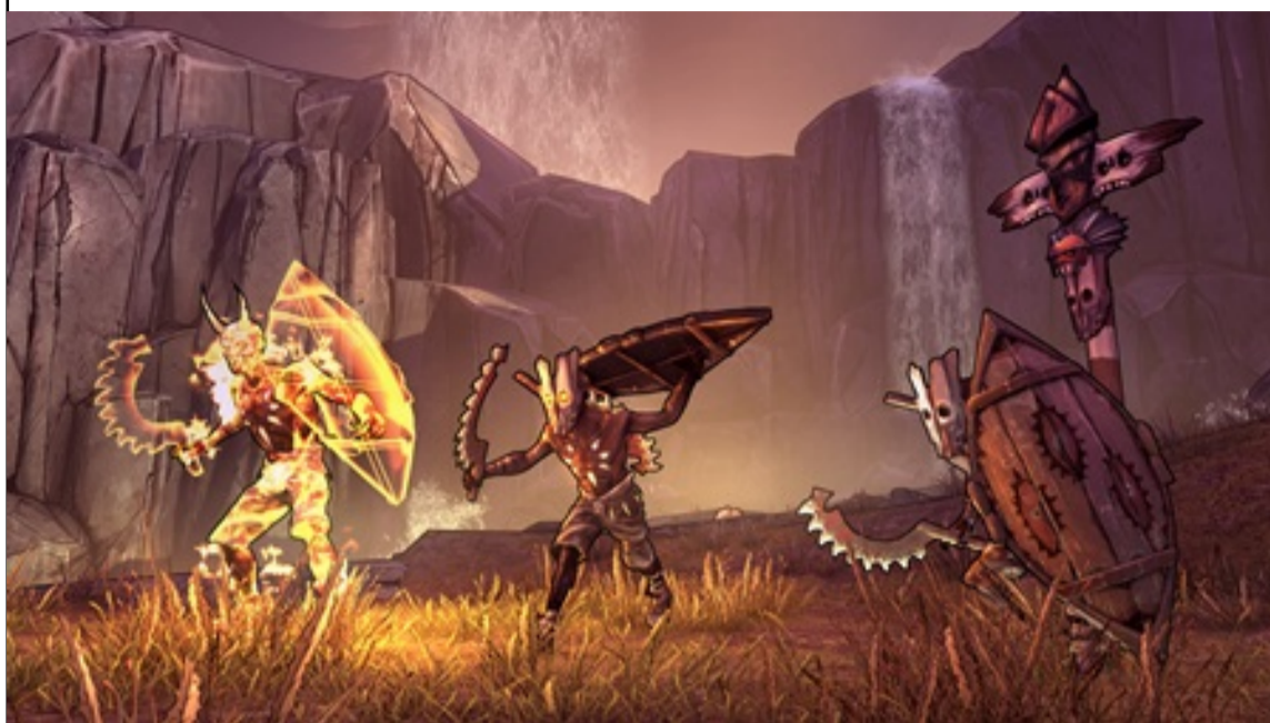
Borderlands 2: Sir Hammerlock's Big Game Hunt

"Halo"-esque wide-open battlefield style gameplay engine pretty well - but - save for some vehicle sections, it's *all* the game does. This is great for gamers who consider themselves FPS fanboys, the type who enjoy this sort of thing, as well as for less trigger-happy gamers who are in it for the RPG and Loot, and enjoy games like "Diablo" or "World of Warcraft" and are used to fighting mob after mob after mob with the hopes of acquiring some shiny trinket that boosts their stats. While those two groups very likely make up a significant portion of "Borderlands 2"'s audience, personally I belong to a third group of gamers with relatively short attention spans that want to be entertained in a variety of ways - which is ultimately why humor is so important here. While the game may occasionally become repetitive the characterization and writing ensures it's never boring.