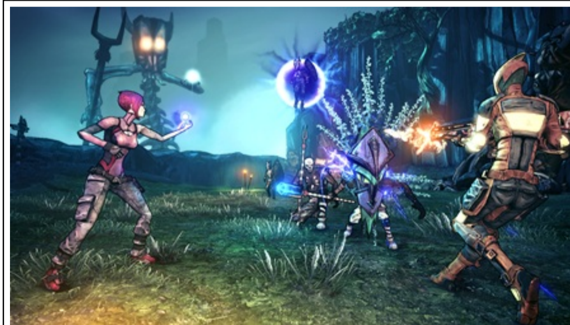
Borderlands 2: Sir Hammerlock's Big Game Hunt

Also new is a whole group of enemies that challenge you to out-think and out-gun them. The aforementioned Drifters (who appeared in "Borderlands" the first) require you to flank around their lanky legs and armored body, and if you'll pardon the parlance, put the boots (well, bullets), to their illuminated neon poop shoot. You'll also come across a variety of different Witch Doctors who have a whole slew of unique abilities, including the ability to buff their cohorts and turn invisible and teleport around the map. It's this kind of content that makes a DLC worthwhile - it's easy to have new enemies that you kill like the old enemies, but were stronger or had more HP, but attention was given to making sure that the new baddies had to be combated in new ways, and it breathes fresh air into a "BL2" experience that, as mentioned above, can occasionally feel a little stuffy.