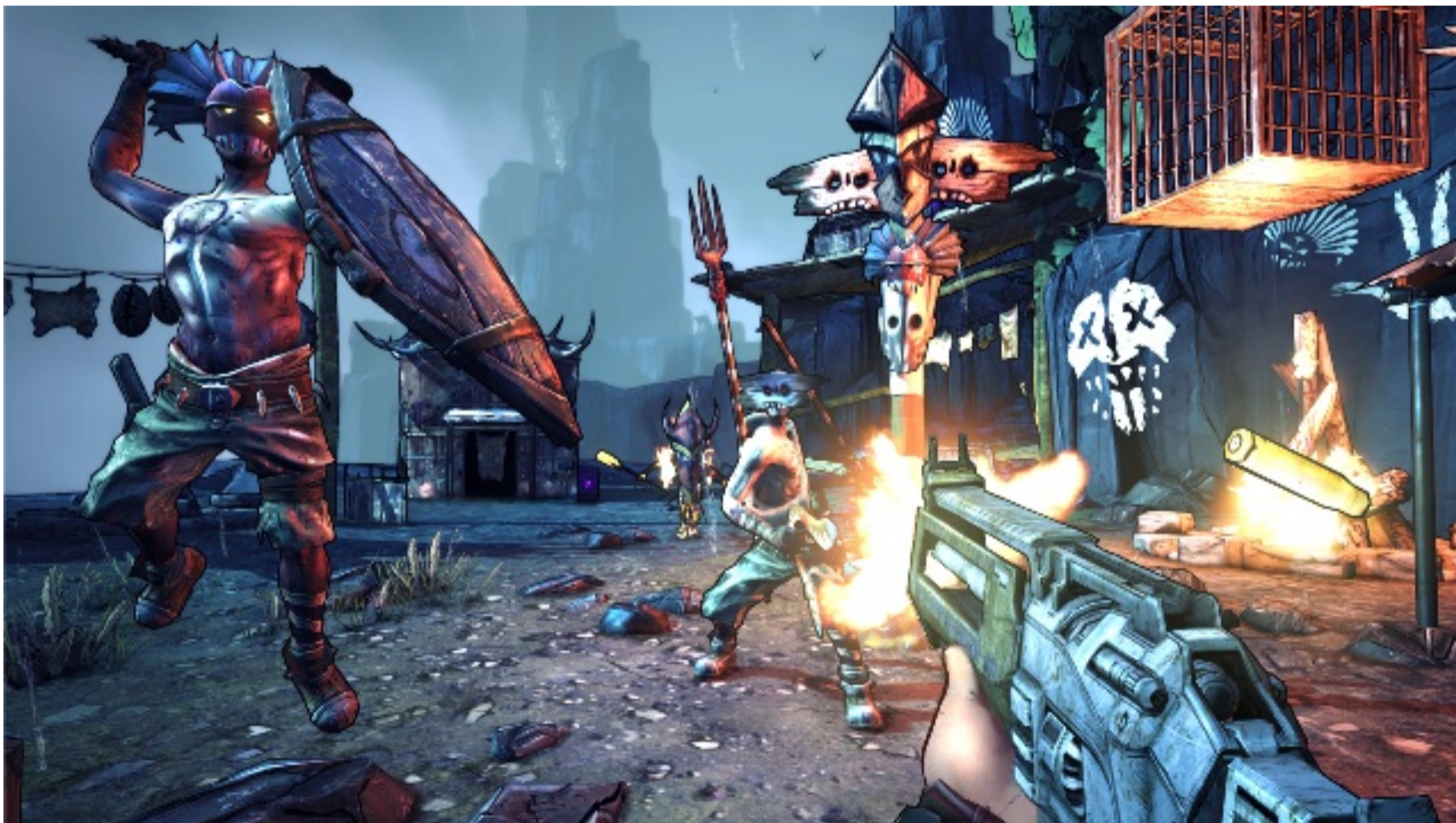
Borderlands 2: Sir Hammerlock's Big Game Hunt

Humor is a highlight of the entirety of the “Borderlands 2” experience, and is absolutely fundamental to the success of its DLC. If Gearbox released DLC content updates without the same creative energy with which they gave us the chaotically ribald Claptrap or the diabolically satanic Handsome Jack, they would have been D.O.A. simply because after 20-30 hours with the main game, the repetitive-by-design mechanics of “Borderlands 2” start to feel a bit worn.