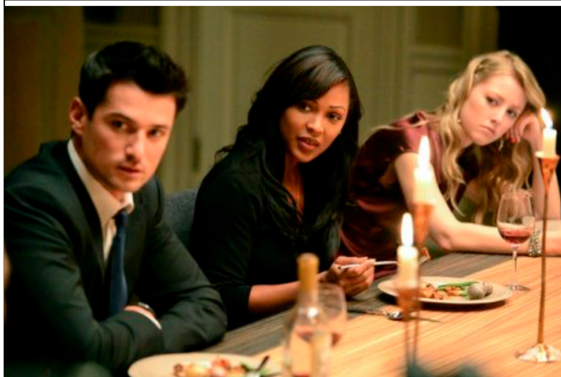
Deception

pharmaceutical empire but she's dead on a hotel room floor before the credits roll. She has an odd-shaped mark on her cheek (perhaps a ring imprint) and drugs in her system. The media and police first presume it's just a rich girl who had too much illegal candy but things quickly turn more mysterious and a childhood friend of Vivian's named Joanna Locasto (Meagan Good), who is now a Detective, decides to find her killer.