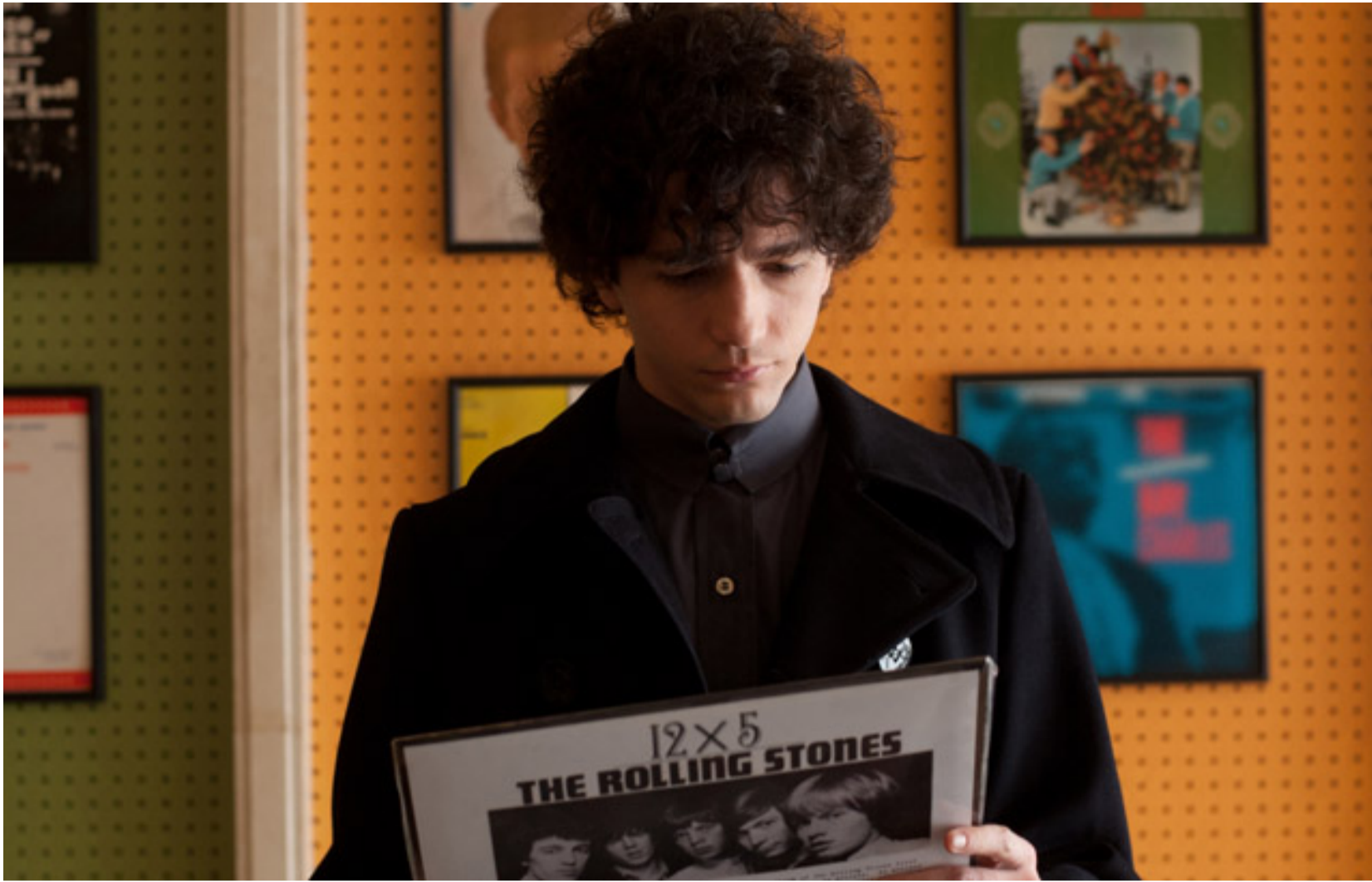
Douglas (John Magaro) Contemplates his Future in David Chase's 'Not Fade Away'