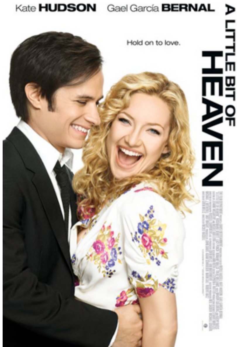
A Little Bit of Heaven