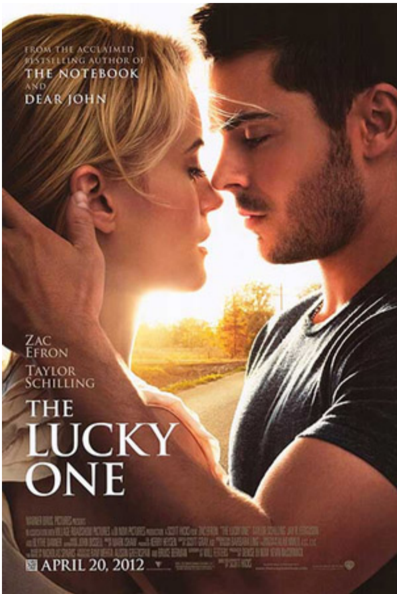
The Lucky One