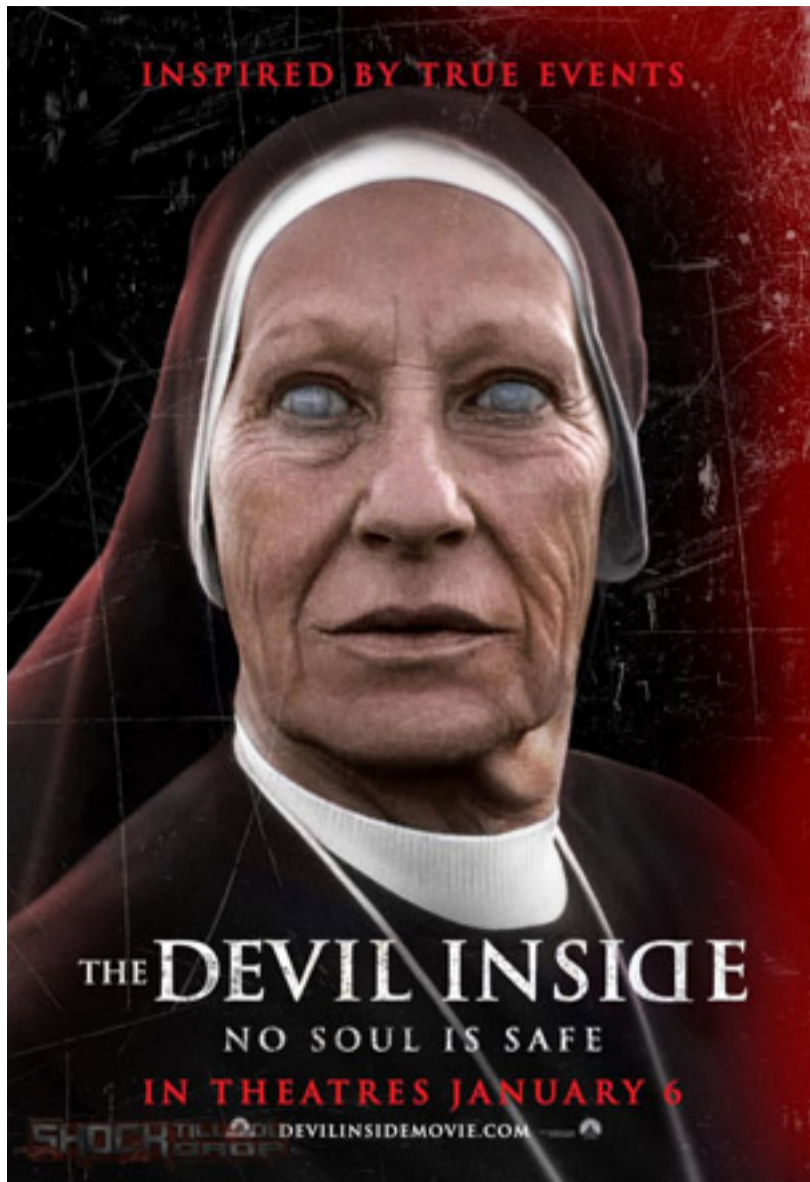
The Devil Inside