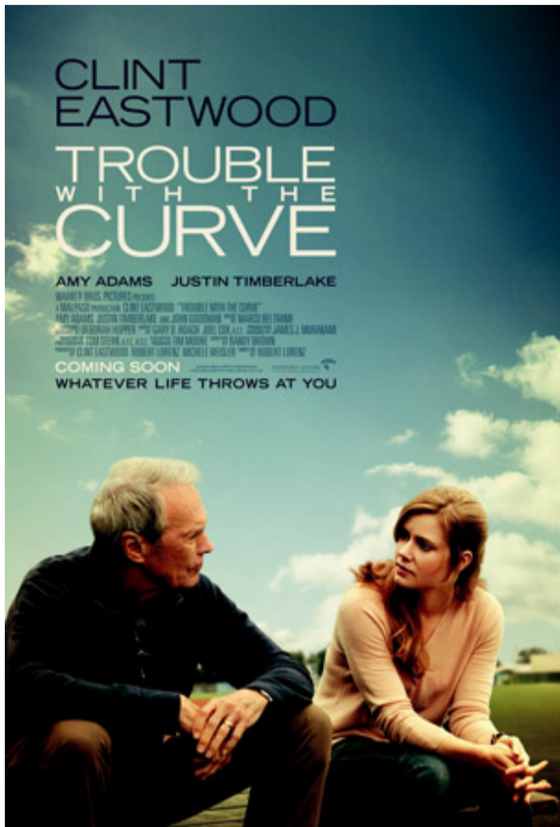
Trouble with the Curve

Oy, the trouble with this movie! Let’s start with the miscasting – Amy Adams and Clint Eastwood have no chemistry as the daughter and father (the aging baseball scout), Justin Timberlake – as a baseball scout colleague – is as sports oriented as you’d expect from an ex-boy band singer, and John Goodman is just same old, same old as a baseball executive. The baseball itself is useless in any basis in reality and the ending – when a phenom comes out of proverbial woodwork – is impossible to believe in this era of traveling youth leagues. Instead of Clint capitulating to his golden years, he of course he is ultimately right and heroic in the film. So much for nuance. I count five strikes, two more than necessary for an “out!”