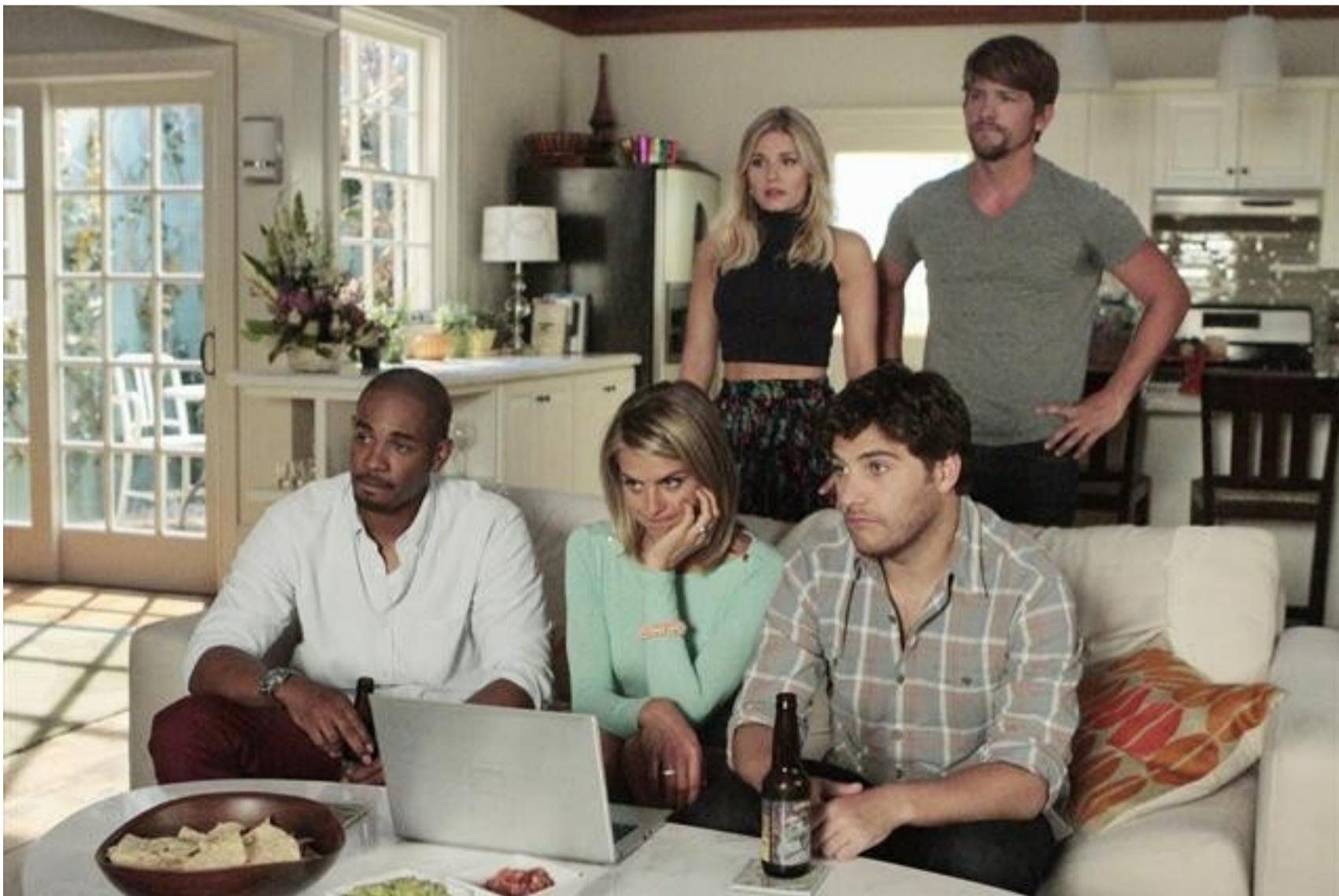
Happy Endings

Perhaps there’s a better question — which ones are worth your time? I think the reason I lead with the pile-up of similar programming is because the quality level is also similar across the board. “New Girl” is probably the best of the six comedies but ABC may have the best overall hour with the smartly written and wonderfully cast “Happy” and “Apt. 23.” The former returns tonight with a slightly subpar episode but picks up next week while the latter returns more confident than ever. Overall, it’s a very solid hour of comedy. There’s room for improvement on both programs but these are shows I hope are given time to swim in this crowded pool (or are quickly moved to another one).