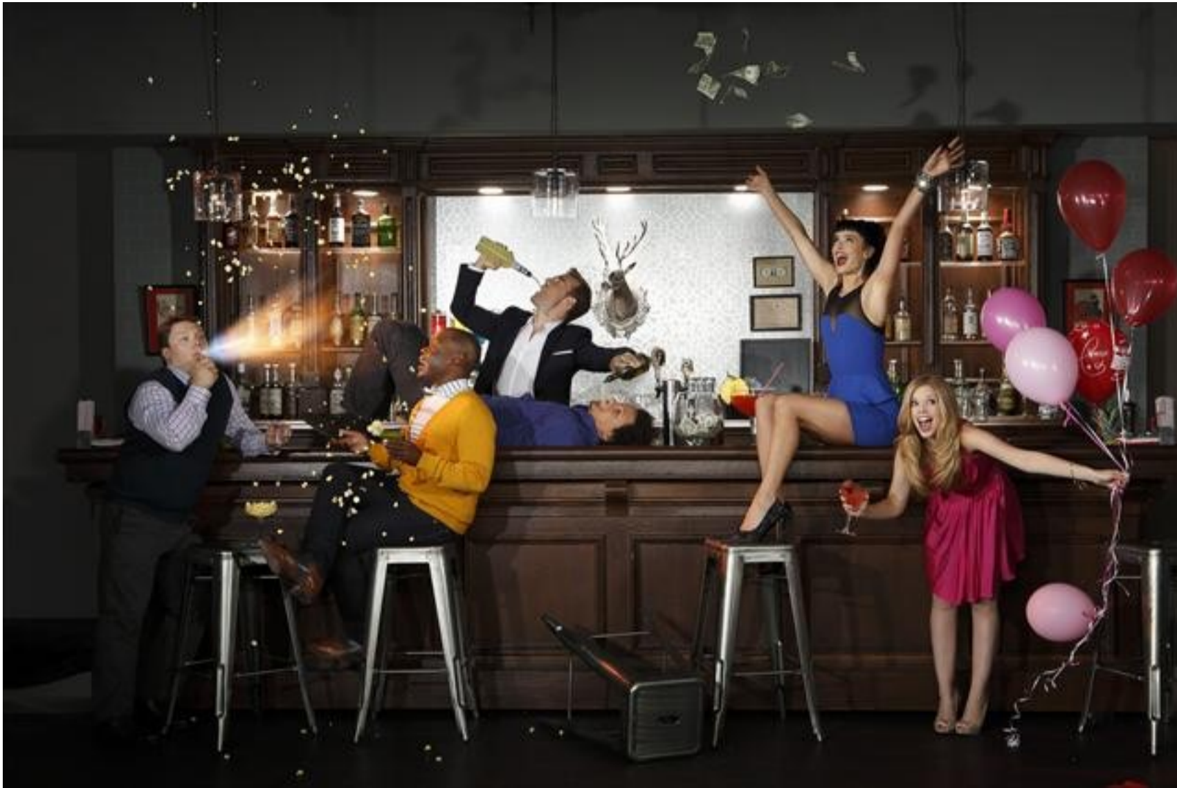
Don't Trust the B---- in Apt. 23

The primary plot of "A Reunion..." centers on James discovering that the letter he's received every year from former "Dawson's Creek" castmates begging him to do a reunion was forged by Chloe (Krysten Ritter) in a manipulative move to make him feel better and do more for her. Of course, this just makes him want to do the reunion even more and June (Dreama Walker) pressures him with some hilarious presentations about the importance of "Dawson's." Busy Philipps, Mark-Paul Gosselaar, and Frankie Muniz guest star.