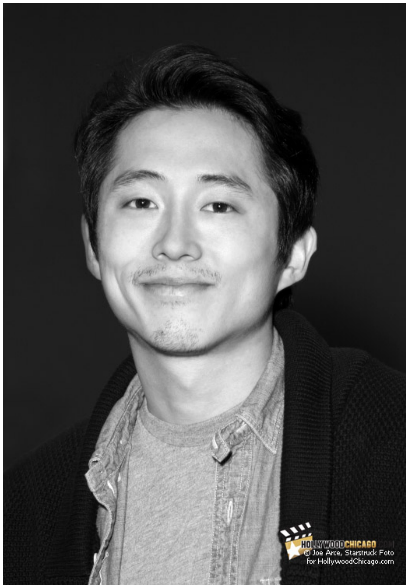
Steven Yeun of 'The Walking Dead' at C2E2 in Chicago, April, 2012

Steven Yeun was in Chicago in April at the Chicago Comic & Entertainment Expo (C2E2) and talked with HollywoodChicago.com about "The Walking Dead."