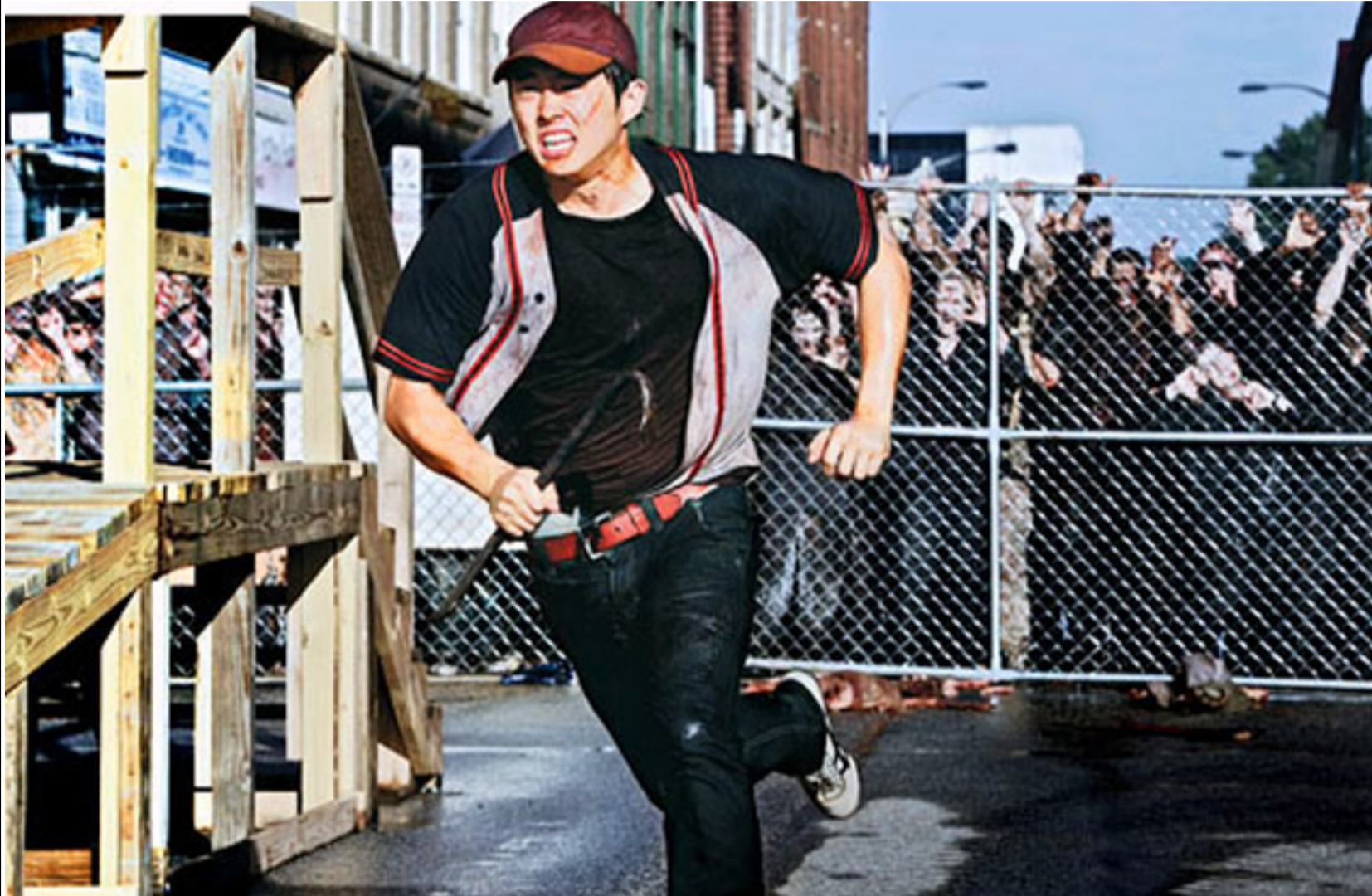
Steven Yeun as Glenn in 'The Walking Dead'

Yeun: The key is consensus. We want to share the same ideas about the characters. Rather than being 'I don't want to do this' and the producers or director acquiescing, it's about how we get there together. What is great is that they trust the actors to get a grasp onto the character, and we trust them to create accordingly. It's a very together process.