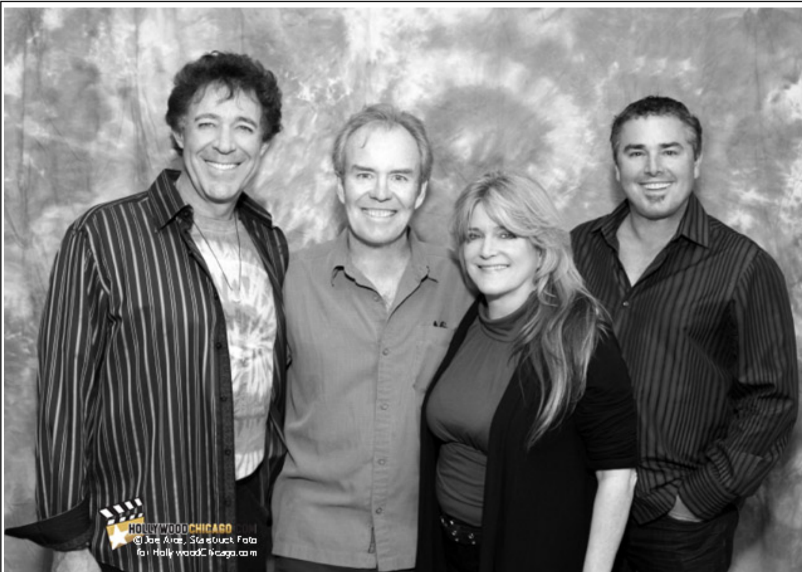
Barry Williams, Mike Lookinland, Susan Olsen and Christopher Knight at ‘The Hollywood Show,’ March of 2012

HollywoodChicago.com was at the event to interview all four of the 1970s icons, with photographer Joe Arce capturing a memorable group photo.