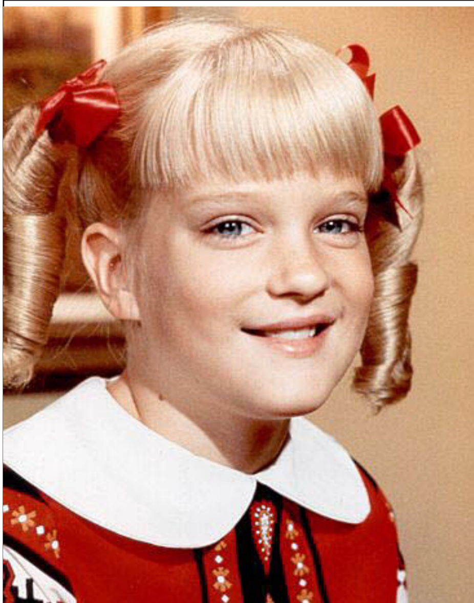
Susan Olsen as Cindy Brady

HollywoodChicago.com: You came from a large family yourself, and your brother was in a Hitchcock movie, right?