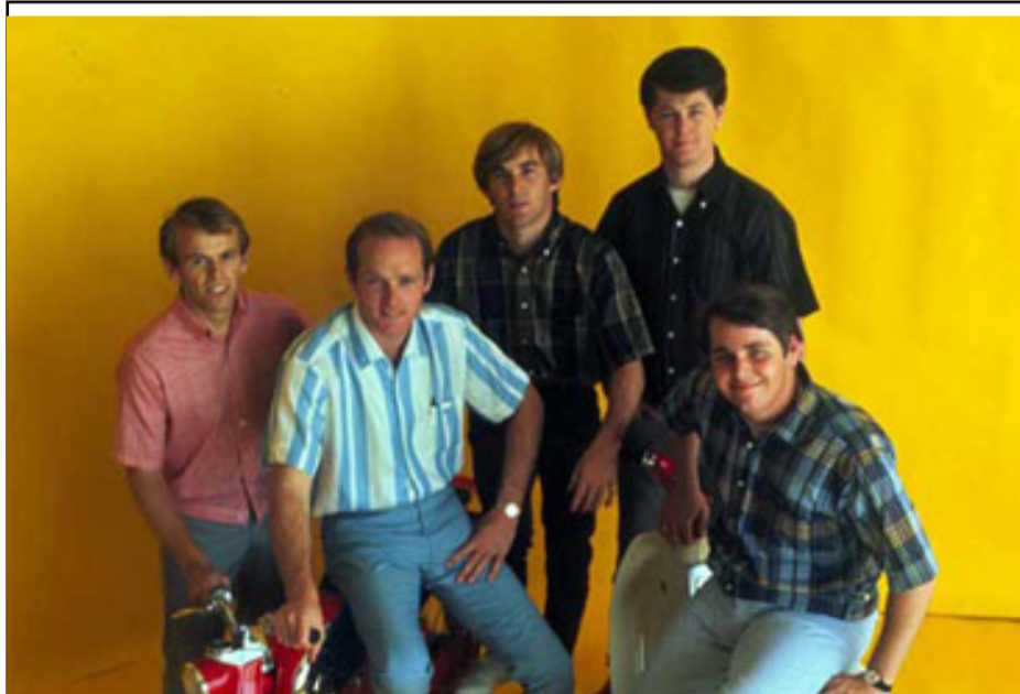
The Beginning, L-R – Al Jardine, Mike Love, Dennis Wilson, Brian Wilson, Carl Wilson

HollywoodChicago.com: You famously left the band in 1962 after your initial success, only to rejoin a year and a half later. Were you itching to get back or was it Brian's insistence that convinced you to do it again?