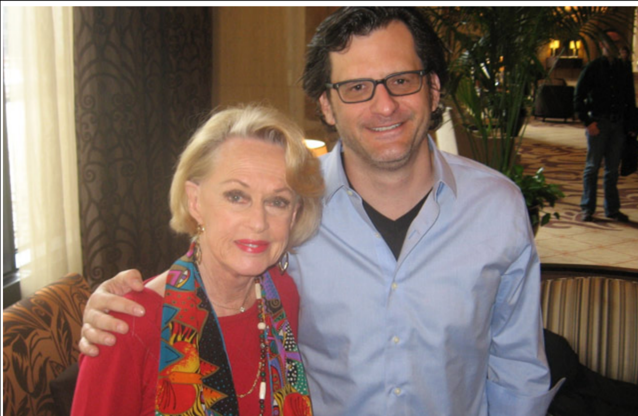
Tippi Hedren and Ben Mankiewicz in Chicago, March 27th, 2012

Ben Mankiewicz started as newscaster in South Carolina, and worked his way through radio and television until he landed as weekend host at Turner Classic Movies. In 2008, he was tapped – along with co-host Ben Lyons – to replace Roger Ebert and Richard Roeper on the syndicated "At the Movies." The "Two Bens," as they were called, endured some critical backlash and were replaced on the show in 2009.