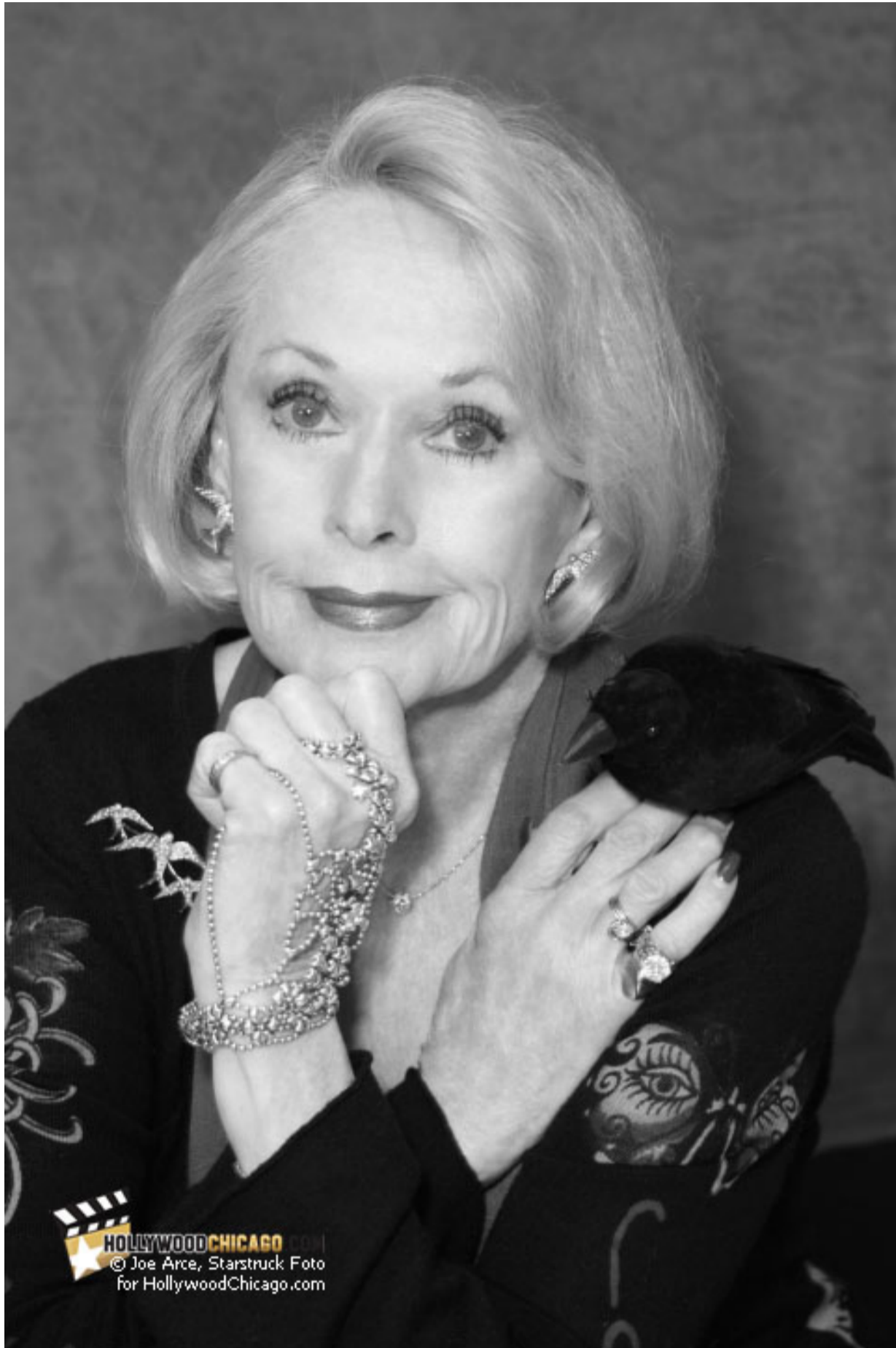
Tippi Hedren in Chicago, March of 2011