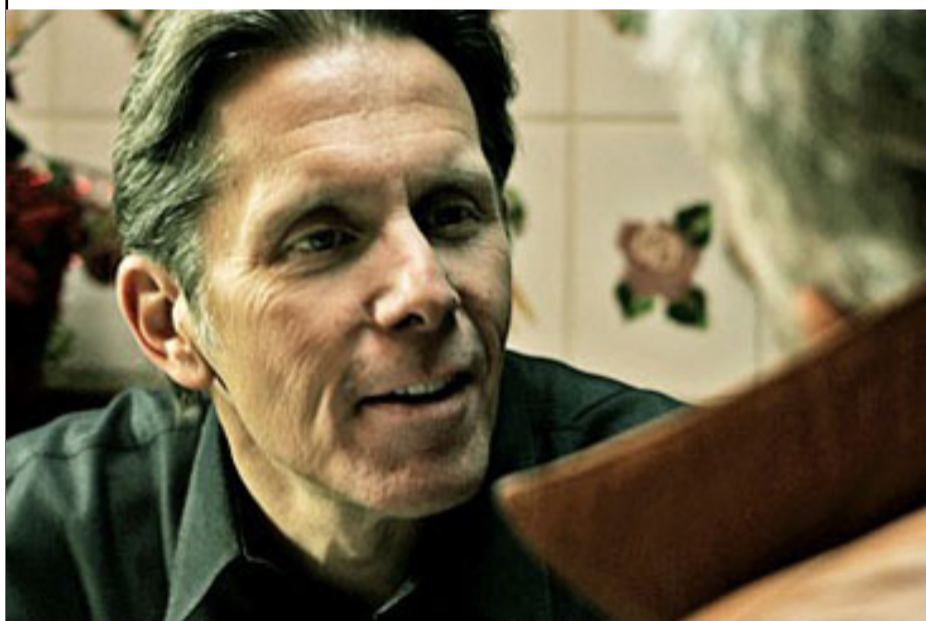
Gary Cole in 'The Last Rites of Joe May'