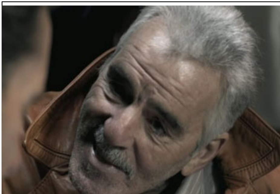
Dennis Farina in 'The Last Rites of Joe May'

Farina: I'd like to think he is, but Joe is the kind of character, if he's on that journey, he'd like to sell some crosses along the way. [laughs] In God's good graces, that is how he would welcome Joe.