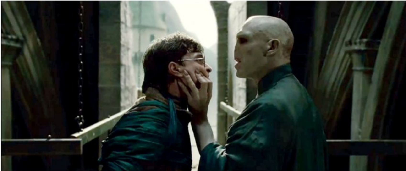
Harry Potter and the Deathly Hallows — Part 2

There’s no point in getting too deep into my critical opinion of the film itself, which you can read here [14]. Briefly, “ It’s hard to imagine fans leaving the final “Potter” film with deep disappointment in this satisfying conclusion. But “satisfying” is not the same as captivating, magical, or spectacular. “Deathly Hallows” is none of those things. It’s a well-executed slice of fantasy entertainment that nonetheless fails to rise to the level of true classic. ”