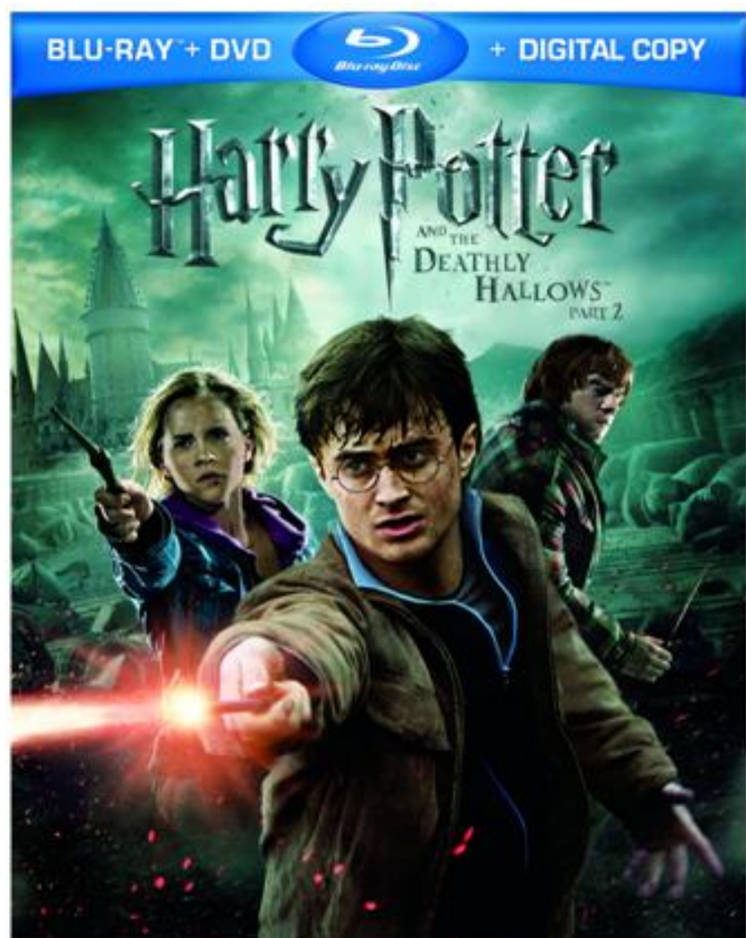
Harry Potter and the Deathly Hallows — Part 2 was released on Blu-ray and DVD on November 11th, 2011