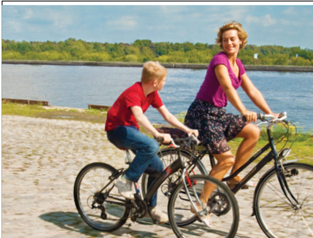
The Kid with a Bike

It would be too easy to describe Sean Durkin’s highly-acclaimed debut as the “Winter’s Bone of 2011.” Like that Oscar nominee, “Martha Marcy May Marlene” started its buzz at Sundance, features a striking debut female lead, and both even have the great John Hawkes delivering stellar supporting performances. But “MMMM” stands completely on its own as one of the most memorable dramas of the year. I’ll admit to a bit of trepidation after first seeing it, thinking perhaps it was a bit too purposefully vague in its storytelling, but I think it’s the question marks left by the film that really allow it to linger in the memory. Well, that and what is easily one of the best performances of the year in any category from the great Elizabeth Olsen (who we were lucky enough to interview...watch for it in a few weeks). This talented young lady perfectly embodies a woman who runs away from one fractured family in the form of a deadly-dangerous cult to return to another fractured family with her sister and brother-in-law. As she tries to remember what happened to her at the cult, the narrative twists and turns like a Moebius strip blending mysterious flashbacks with her confusing present until the tension reaches a peak in the final act.