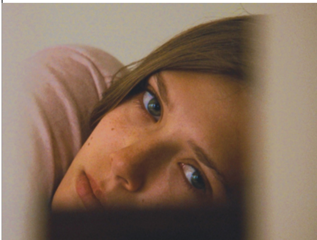
Martha Marcy May Marlene

evenly-split-into-two-chapters film that she absolutely has not. The second half consists of the rest of her family fearing that the planet Melancholia will crash into their lives as well. We will write a lot more about this film for its theatrical release and, in all likelihood, in year-end features here on the site. It's that good.