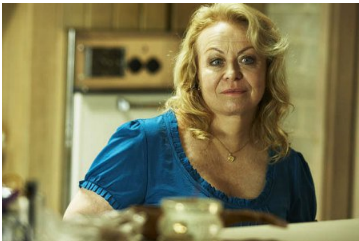
Jacki Weaver

Very few women have ever owned the final act of a film as completely as Jacki Weaver owns "Animal Kingdom." Especially a crime film. For the majority of its running time, "Animal Kingdom" is a testosterone-heavy tale of bad men doing bad things and the other men trying to stop them but then Weaver gets her turn in the spotlight and we realize that the queen of the lion's den is arguably the most dangerous creature on the plain. As the house of cards she's helped create in her family of criminals starts to collapse, Weaver moves into the spotlight and the movie goes from good to near-great. She perfectly embodies a woman who doesn't fit the typical description of a criminal mastermind and has probably never gotten her hands dirty herself but certainly knows how to make the tough decisions, beautifully delivering lines like " Just because we don't wanna do something doesn't mean it can't be done. " Reminiscent of one of the best TV characters of all time, Livia Soprano, Janine Cody is a woman comfortable in domesticity or going head-to-head with the policeman trying to take her down. You don't mess with a lioness.