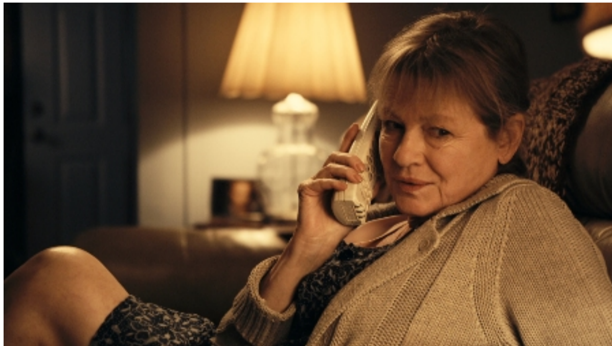
Dianne Wiest

What is there to say about Dianne Wiest other than it would a better film world if she acted more often? She was spectacular on “In Treatment” but it’s been too long since she delivered a performance as resonant as Nat in “Rabbit Hole.” The mother of Nicole Kidman’s Becca, Nat is similarly without a road map in the world of tragedy and yet she could also be the only one who knows how her daughter feels. Nat lost a child too when Becca’s brother died of an overdose. The fact that losing a young child is different than losing an older child is unimportant to Nat — her son died. And it’s a situation that has clearly shaded her entire relationship with her daughter. She wants to relate but clearly does so too much for the sanity of her daughter and, consequently, doesn’t know how to help. Wiest delivers a brief-but-amazing performance, taking her few scenes and using them to ultimate effect. In fact, “Rabbit Hole” isn’t nearly as complete a film without her as Wiest adds a much-needed view into the tragedy of Becca & Howie in that she both knows their tragedy and yet doesn’t quite. She grounds the piece as she has done in so many other films and as we’d love to see her do in so many more.