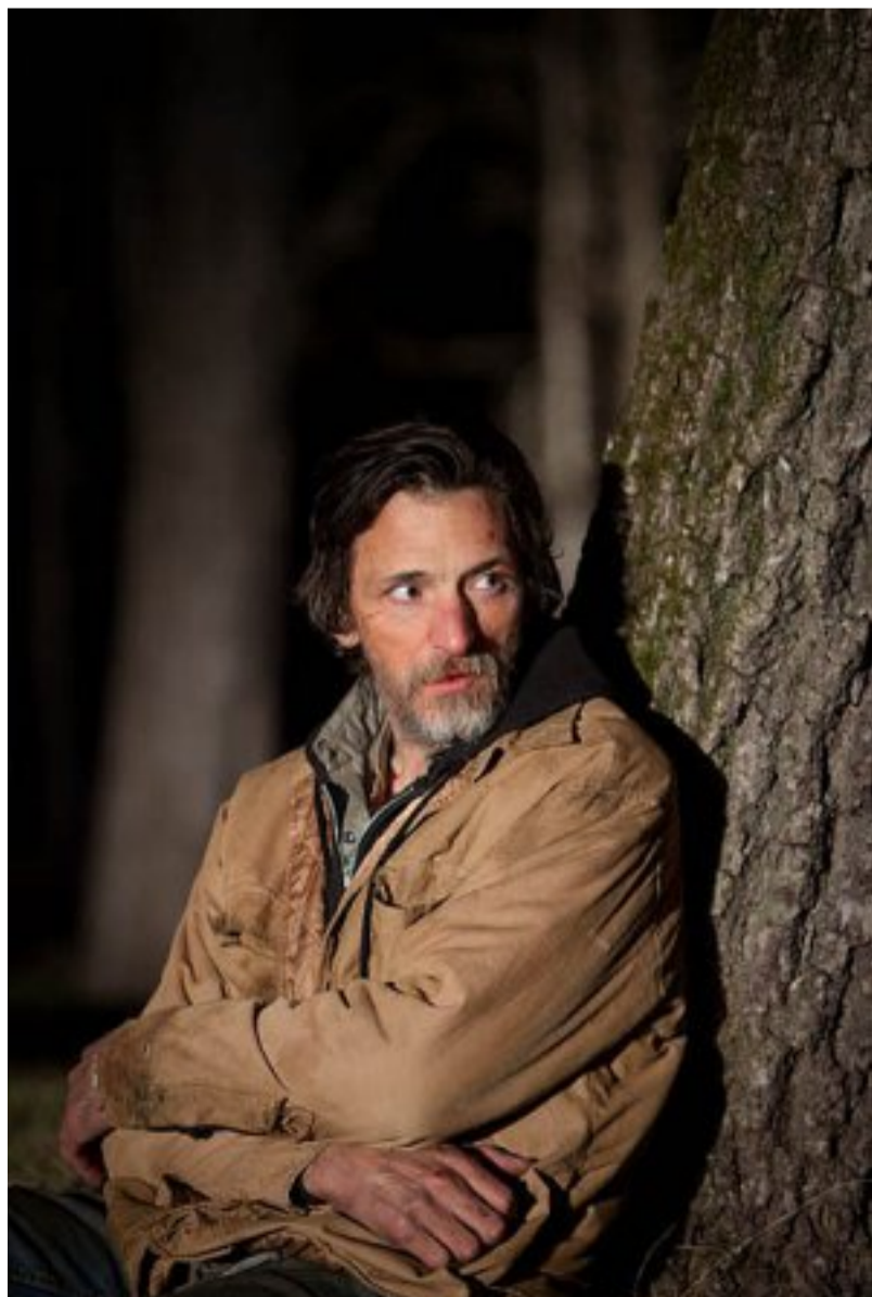
John Hawkes