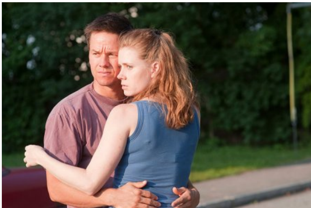
Amy Adams

There was reason to worry about Amy Adams. Her performance in “Julie & Julia” was overshadowed by her co-star, the less said about that awful “Night at the Museum” sequel the better, and most who paid to see it have repressed “Leap Year” out of their memories. It started to look like one of the most promising actresses of her generation would go the way of so many talented young ladies and disappear into crappy studio product. Then Adams proved why she’s already been nominated for Oscar twice and surely will be a third time — when she finds the right material, she’s truly remarkable. What she brings to “The Fighter” is an intangible chemistry that’s essential to the film’s success. From the minute she falls for Mark Wahlberg’s Mickey Ward, we believe it and her devotion to her love is key to the arc of the film. There’s a scene late in “The Fighter” between Bale and Adams on a porch that is a master class in character-driven drama. The brother and the lover of a man realize that they may hate each other but they must unite over a common goal. Adams is stunning in this scene, going through roughly seven emotions in just a few lines. Amy Adams is back and while it would be nice for her excellent co-star to win the Oscar in this category, it would be great for Adams to take what she deserves and never have to consider a “Leap Year” again.