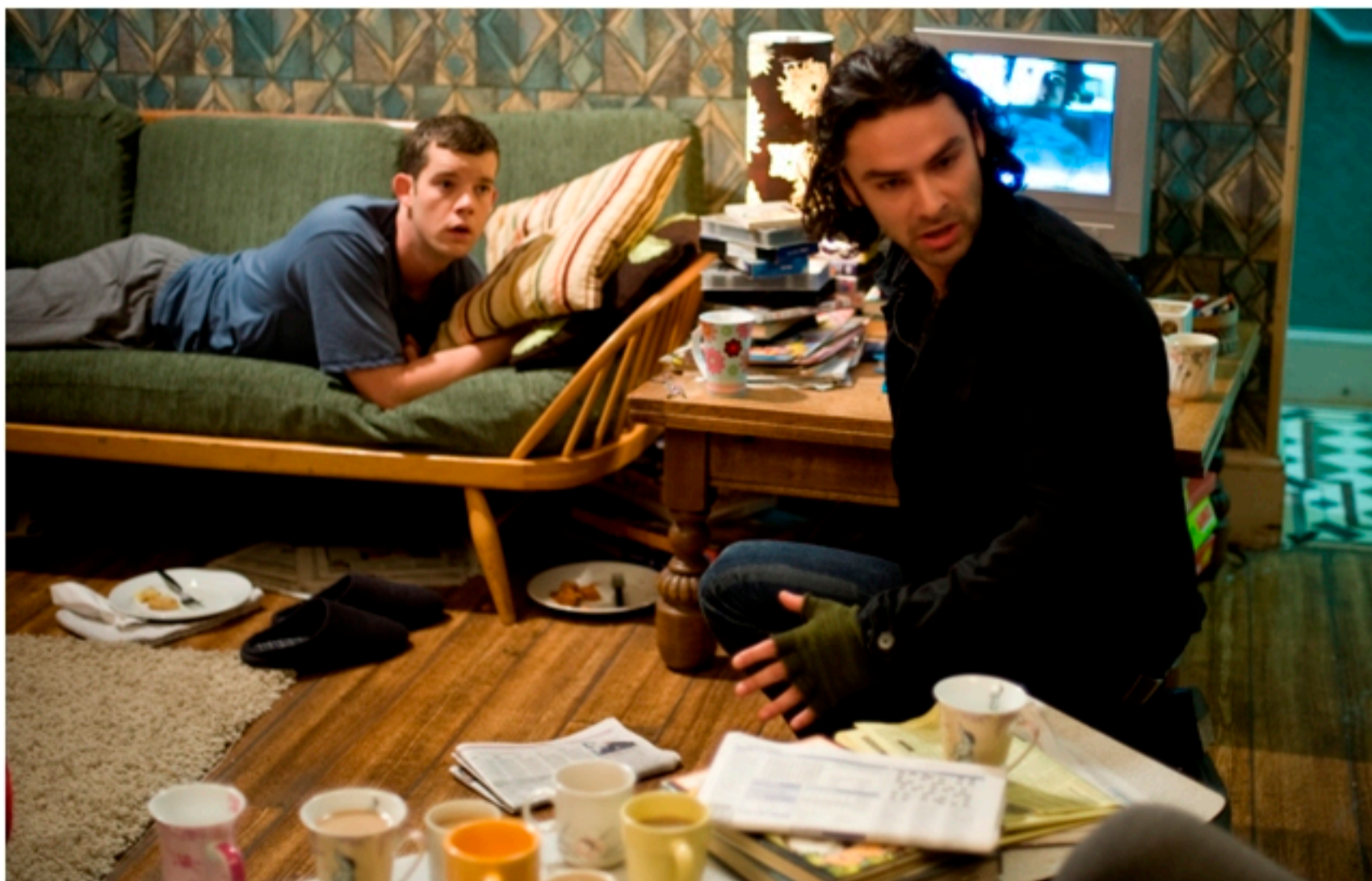
Being Human: Season Two was released on Blu-ray and DVD on September 21st, 2010

Life is not easy for flatmates Mitchell (Aidan Turner), George (Russell Tovey), and Annie (Leonard Crichlow) because, well, they’re not really alive like you and me. Mitchell is a vampire, George is a werewolf, and Annie is a ghost. While it may sound like the set-up for a bad joke — “A vampire, werewolf, and ghost walk into a bar...” — “Being Human” is deep drama even if you’re weary of all things “True Blood” or “The Twilight Saga: Eclipse.”