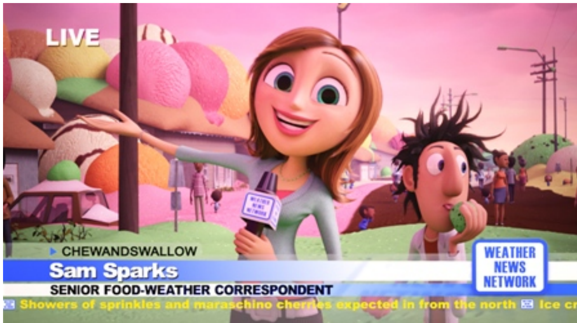
Sam Sparks voiced by Anna Faris with Flint Lockwood voiced by Bill Hader in Columbia Pictures' animated film Cloudy With A Chance Of Meatballs.

Inventor Flint Lockwood (Bill Hader) refuses to give in to his depressing surroundings and works to come up with one great, world-changing invention. Previous attempts include the ill-conceived rat-bird hybrid and a device that translates monkey's thoughts. It turns out that most monkeys think of only their name and what they want to eat. (In a typically surreal move, the end credits reveal that Neil Patrick Harris voices the monkey Steve even though he has nearly no dialogue.)