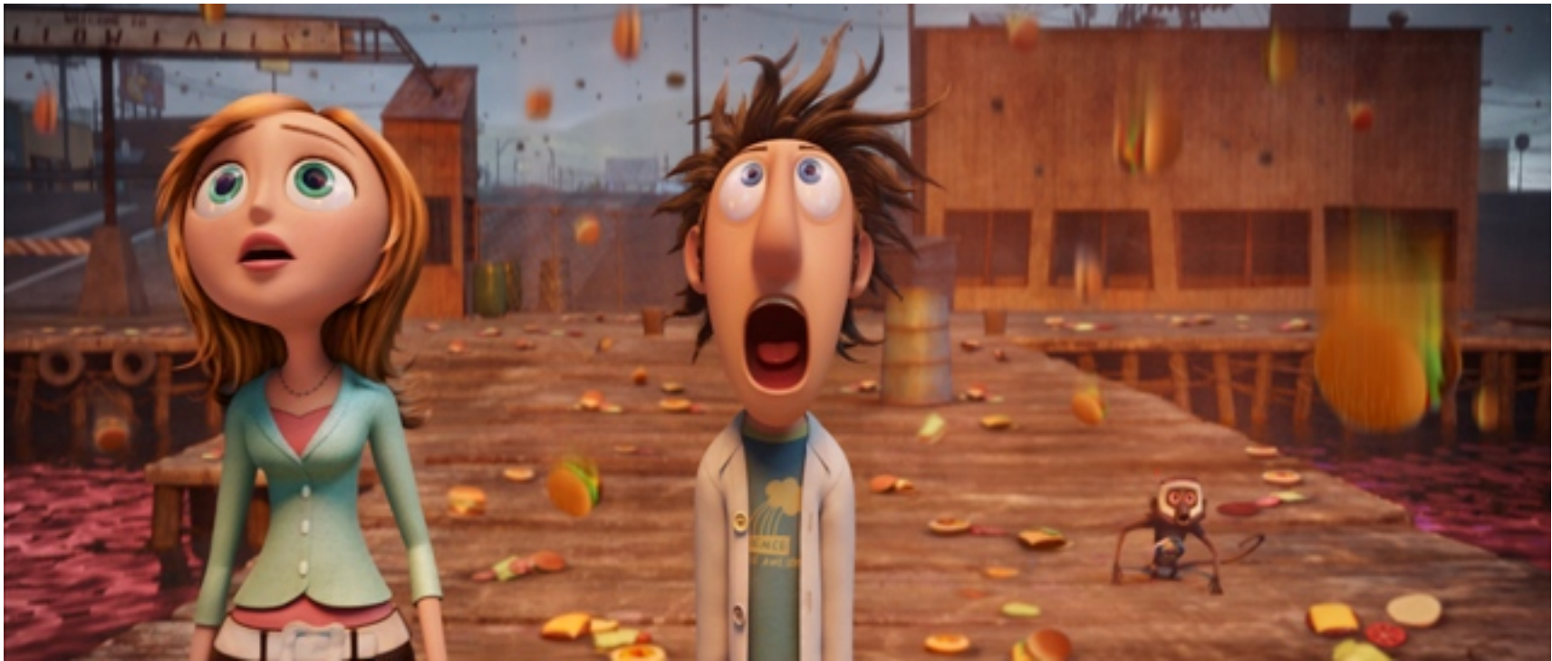
Sam Sparks voiced by Anna Faris and Flint Lockwood voiced by Bill Hader in Columbia Pictures’ animated film Cloudy With A Chance Of Meatballs.

As someone who sees nearly every animated film released in the ’00s, I can tell you that most of them are disposable, interchangeable, and predictable. For every “Up” or “Coraline,” there are a half-dozen “Barnyard” or “Open Season”s. So, it brings me great, surprising pleasure to say that “Cloudy with a Chance of Meatballs” defies all expectations and I doubt any animated film will be as purely entertaining this season. Young kids, older brothers, babysitters, parents, and even grandparents will find something to like here.