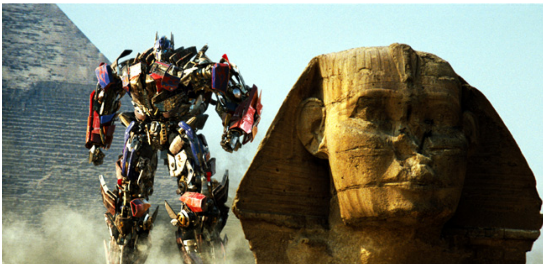
The Autobot Optimus Prime returns to battle the Decepticons in “Transformers: Revenge of the Fallen”.

Not only are the action sequences plenty ridiculous (and endless) but the script (written by Ehren Kruger, Roberto Orci and Alex Kurtzman) is riddled with disappointingly laughable lines. From references to Barack Obama to supposedly serious battle cries of “let’s win this like we always have with a coordinated military strategy,” one is tired simply from groaning by the end of the film.