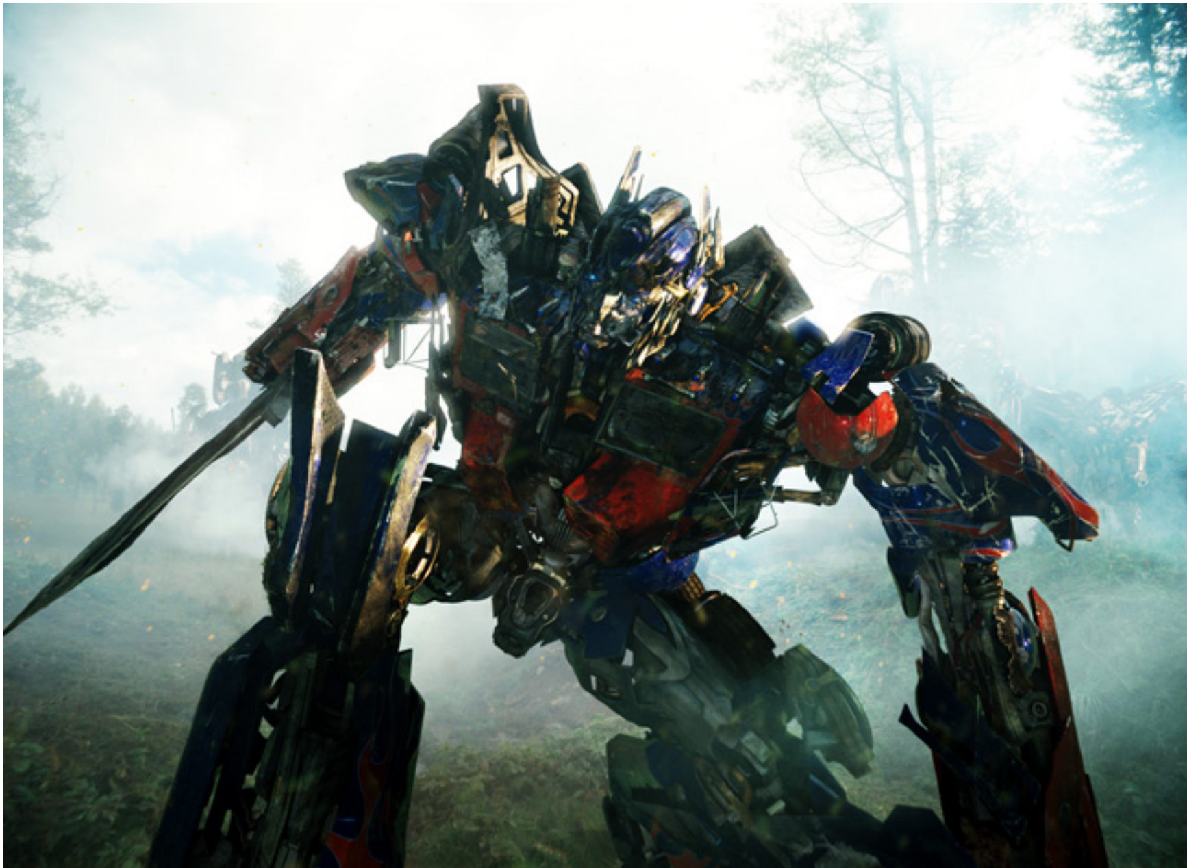
The Autobot Optimus Prime once again does battle with the Decepticons in “Transformers: Revenge of the Fallen.”

Then, before the audience even leaves the ground, alarms sound, the foundation shakes and this invigorating shuttle ride is cancelled. The audience is herded into what feels like a two-hour Segway tour, as we’re led where we don’t want to be and forced to wear goofy helmets of boredom.