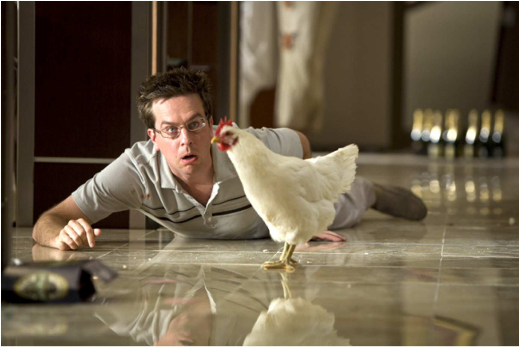
Stu (Ed Helms) wakes up with a hangover and finds a chicken in his hotel room in “The Hangover”.

The foursome splurge on a suite, suit up and head off expecting the typical-atypical of all Sin City has to offer.