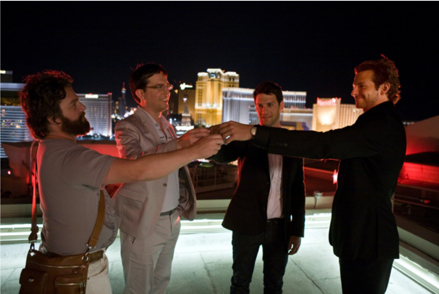
Left to right: Alan (Zach Galifianakis), Stu (Ed Helms), Doug (Justin Bartha) and Phil (Bradley Cooper) raise a toast on the rooftop to commence Doug's bachelor party in "The Hangover".