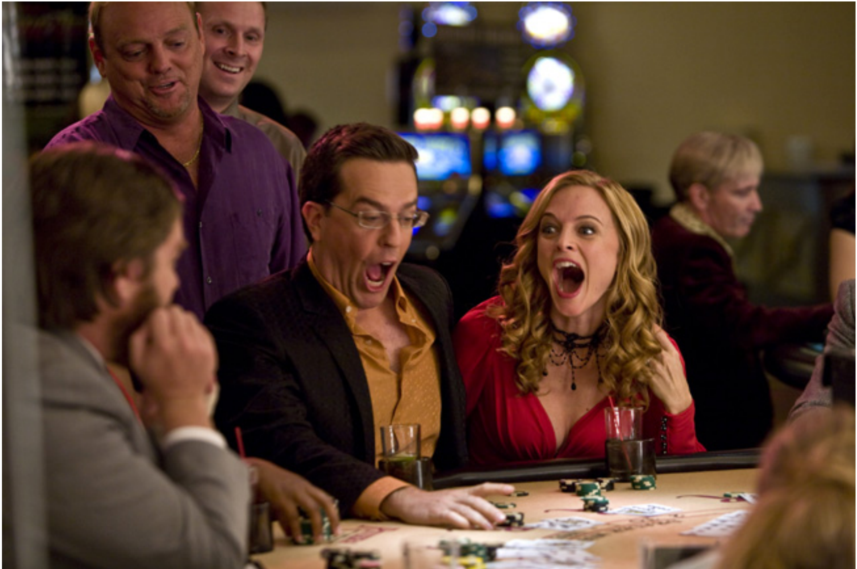
Ed Helms as Stu and Heather Graham as Jade in "The Hangover".