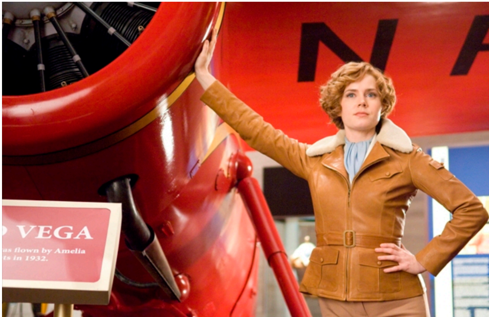
Amy Adams is famed aviatrix Amelia Earhart in “Night at the Museum: Battle of the Smithsonian”.