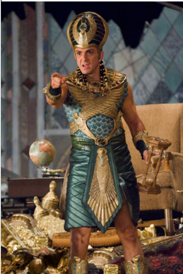
Egyptian pharaoh Kahmunrah (Hank Azaria) strikes a villainous pose in “Night at the Museum: Battle of the Smithsonian”.

Upon opening, we find that former museum guard Larry Daley (Ben Stiller) has left his job at the Museum of Natural History to pursue a more lucrative career: inventor and infomercial personality. It becomes clear through rushed and skipped-about scenes that he’s unfulfilled in his new life and is quickly led back to wander the halls of his former museum-guard dwellings.