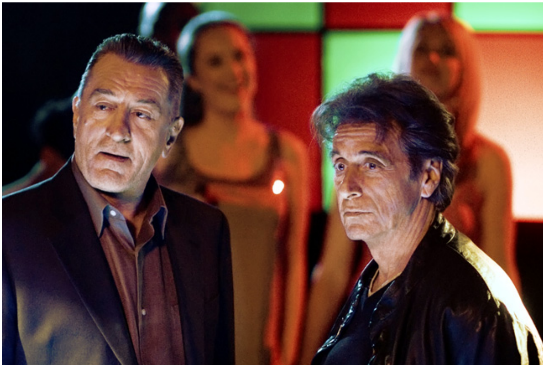
Left to right: Robert De Niro and Al Pacino in "Righteous Kill".

CHICAGO – Last fall, Francis Ford Coppola made the comment that Al Pacino and Robert De Niro (along with Jack Nicholson) had lost their ambition. Coppola essentially said they have been phoning in their performances and picking safer movies. "Righteous Kill" could be the case study to that argument.