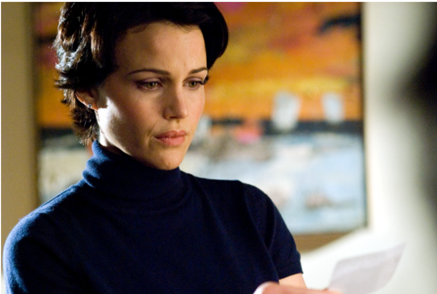
Carla Gugino in "Righteous Kill".

That means you either immediately know he's the killer or you've got a wild twist coming at the end. The story follows most of the murders leading up to the confession and Turk and Rooster's dedication to serving the public. De Niro's Turk is a no-nonsense, short-tempered detective.