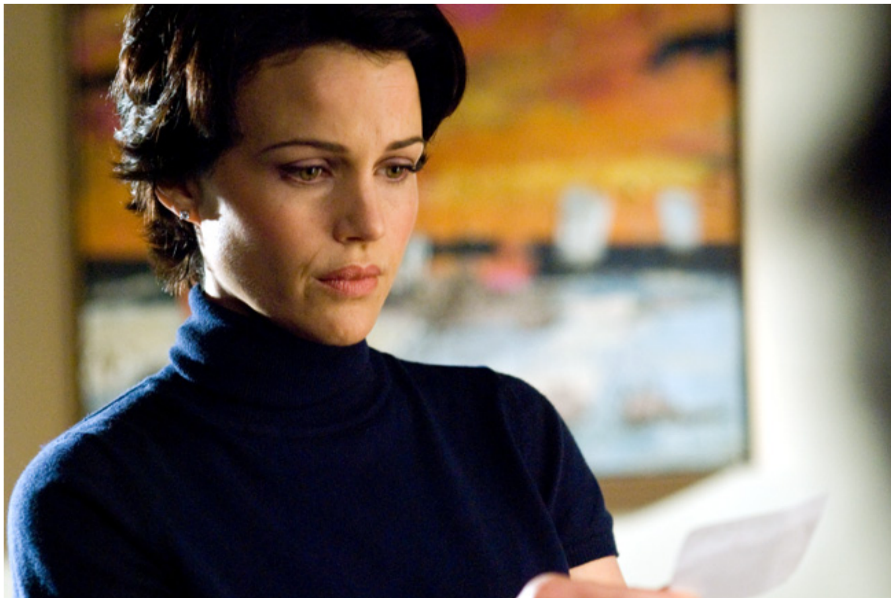
Carla Gugino in "Righteous Kill".

That means you either immediately know he's the killer or you've got a wild twist coming at the end. The story follows most of the murders leading up to the confession and Turk and Rooster's dedication to serving the public. De Niro's Turk is a no-nonsense, short-tempered detective.