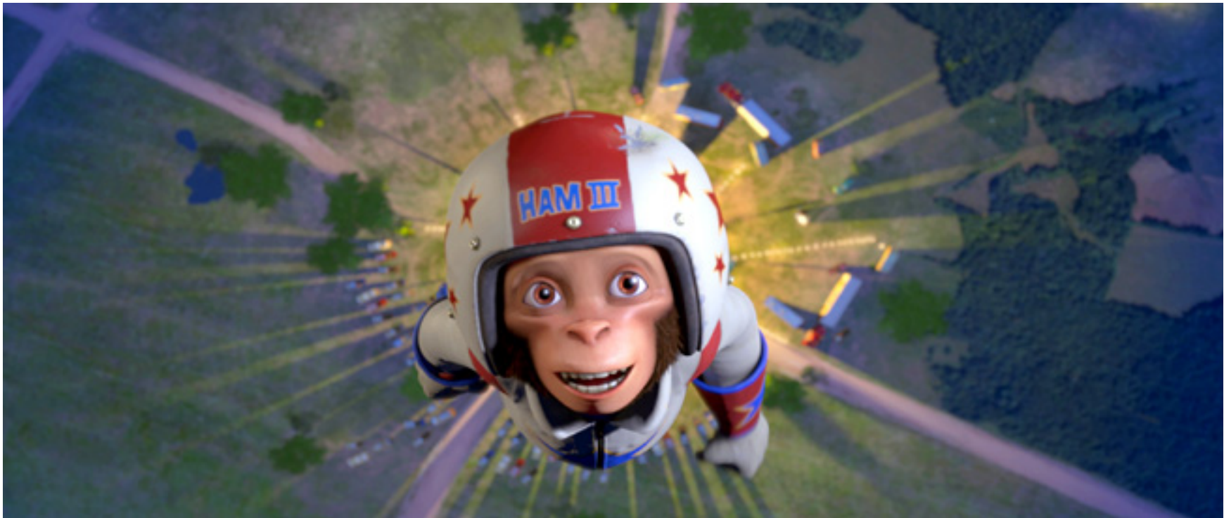
Ham III (Andy Samberg) – the slacker grandson of the first chimp blasted into space before manned spaceflight – takes off into out-of-this-world adventure and comedy in “Space Chimps”.

But where are the monkeys and how long before the first joke about flinging their poo? Both desires are satisfied in the playfully visual and wryly funny “Space Chimps,” which is anchored by the vocal talents of Andy Samberg (“Saturday Night Live”).