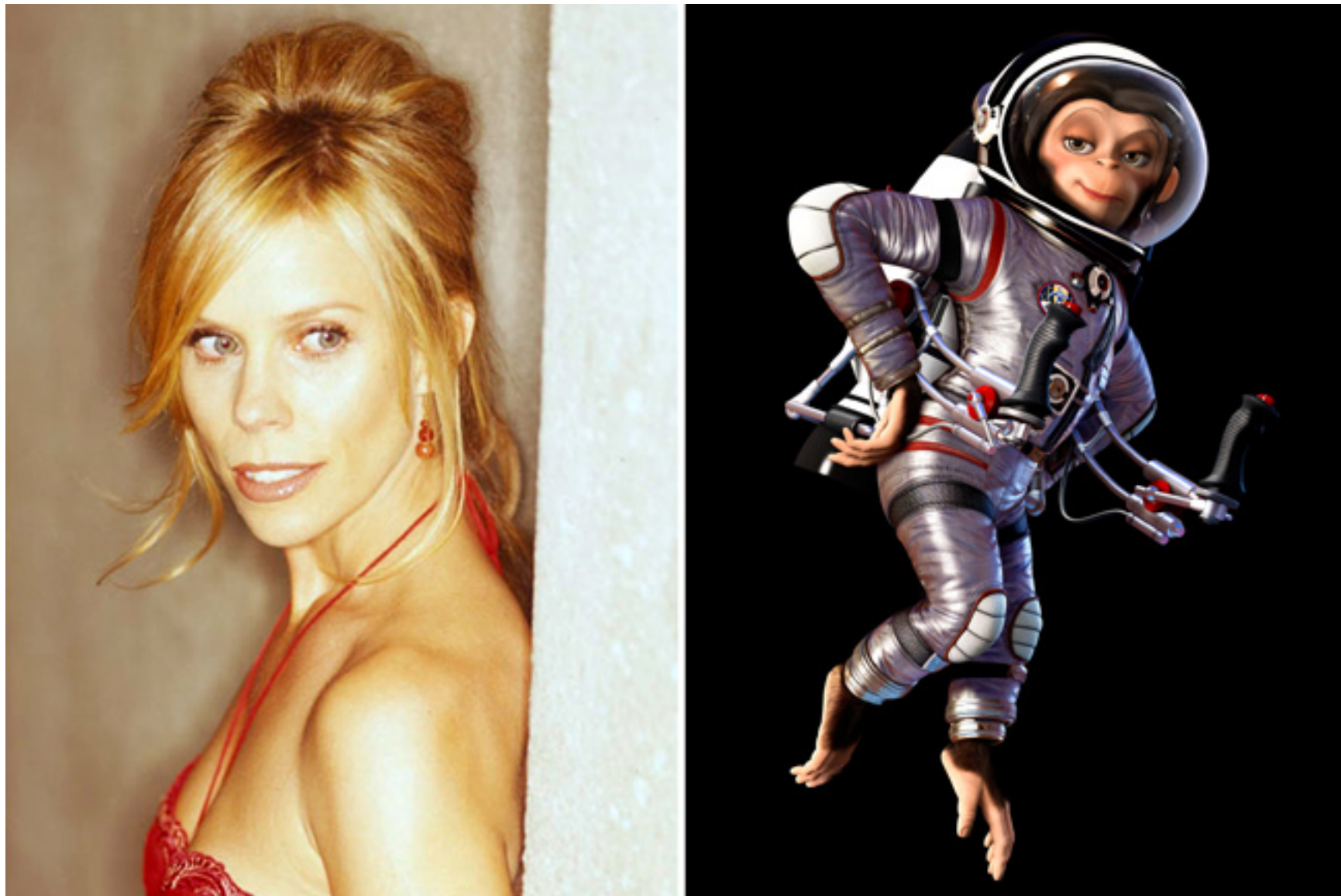
Cheryl Hines voices Luna in “Space Chimps”.

It’s up to the space program on Earth to send another rocket through the wormhole to retrieve the probe. The only problem is that humans might not survive the wormhole experience.