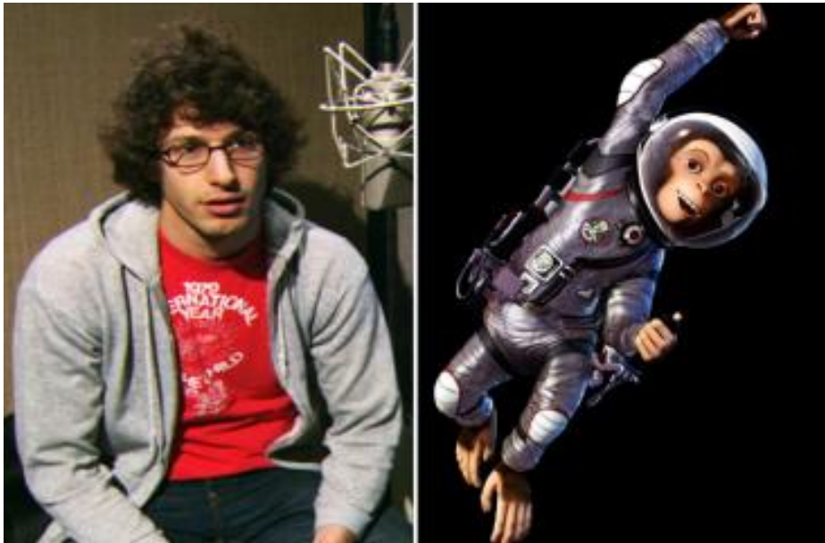
Andy Samberg voices Ham III in “Space Chimps”.