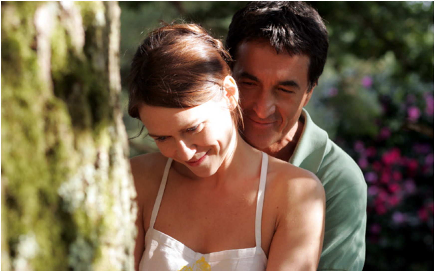
François Cluzet (right) and Marie-Josée Croze as Margot in “Tell No One”.

Describing one of the characters in that film, one line observes that he has “more twists than a barrel of pretzels”. Take that barrel and put it through the zigzag of a taffy-pulling machine and those results might be able to straighten out the labyrinth of circumstances in “Tell No One”.