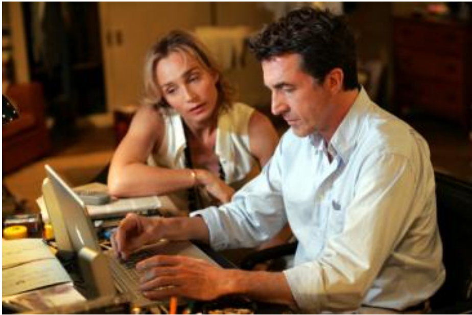
François Cluzet (right) and Kristin Scott Thomas in "Tell No One".

Eight years later and before gathering traditionally with Margot's family to mark the day of the tragedy, Beck receives an e-mail message.