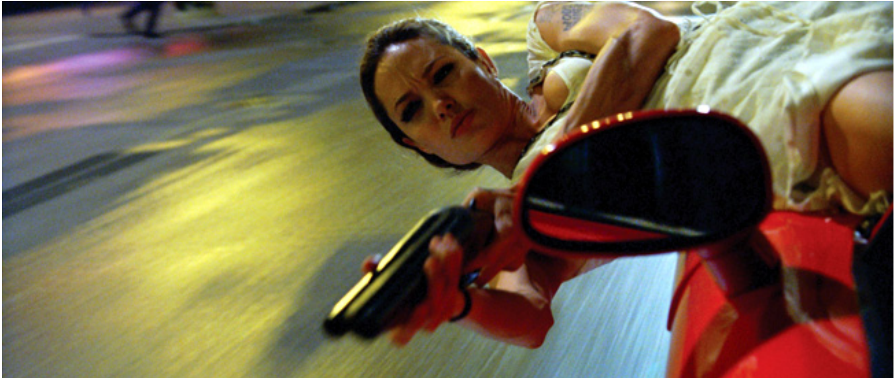
Fox (Angelina Jolie) shoots from the driver's side of her Dodge Viper in the action-thriller that tells the tale of one apathetic nobody's transformation into an unparalleled enforcer of justice in “Wanted”.

CHICAGO – With curving, clinking and kissing bullets, “Wanted” indeed does Chicago proud. And Angelina Jolie sells it. And Morgan Freeman is ominous. And in his body of work, James McAvoy – the star of this orgasmic summer blockbuster – becomes a man.