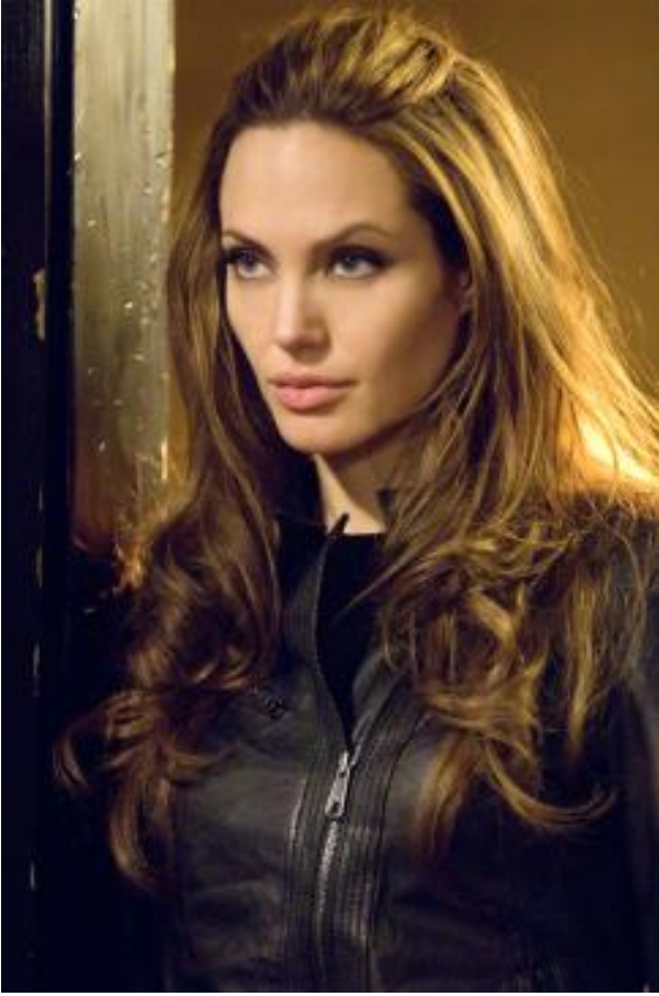
Angelina Jolie as Fox in "Wanted".

After also focusing its filming lens throughout the Czech Republic and Hungary, Chicago's prominence reigns surprisingly dominant and central to the film's assassin-based plot of one "apathetic nobody's transformation into an unparalleled enforcer of justice".