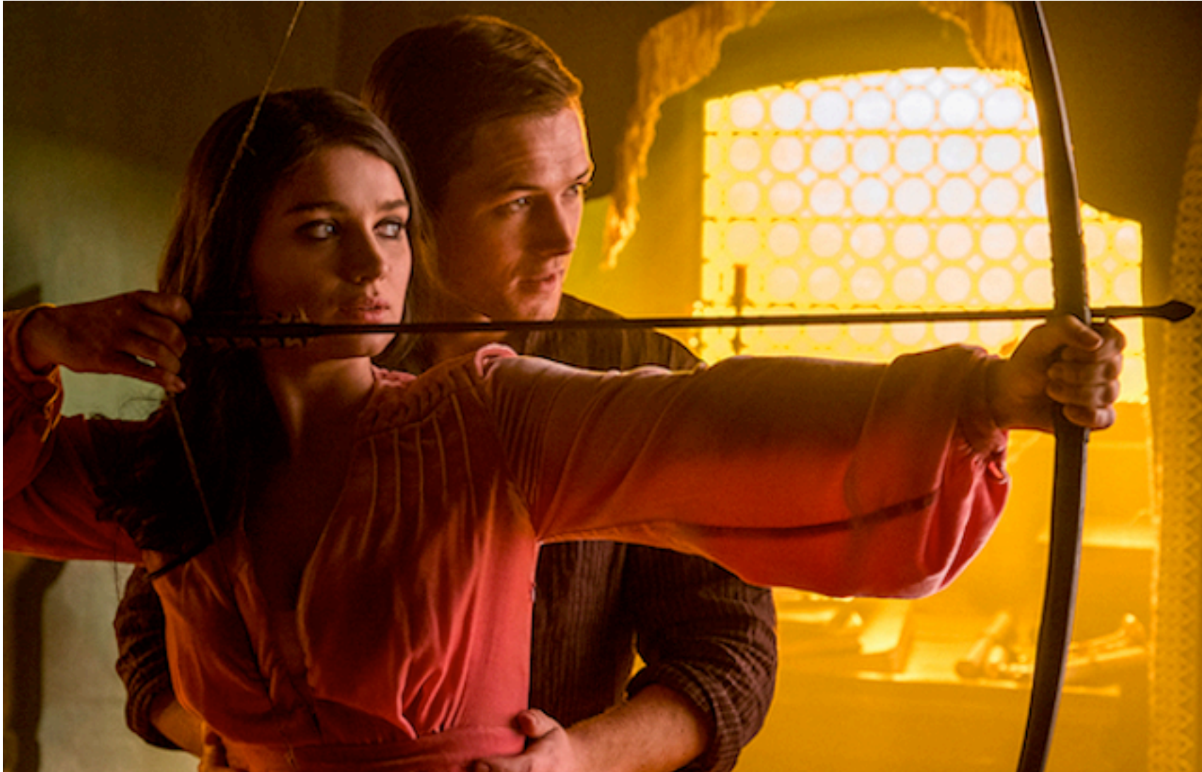
All A-Quiver: Marian (Eve Hewson) and The Hood (Taron Egerton) in 'Robin Hood'

This is also the type of film where everyone is action hero movie predictable, down to perfect make-up for Marian in a filthy mining camp. Robin Hood and John are always the smartest (and where did they get that fire making juice, that stuff was nuclear!) and the Sheriff and his mincing minions are stupid because they are evil, where mostly in real life it’s the opposite. Isn’t Robin Hood a plea also for Communism (the people control the means of production)? Shouldn’t the capitalist pigs of the film industry have stamped their gout-ridden feet?