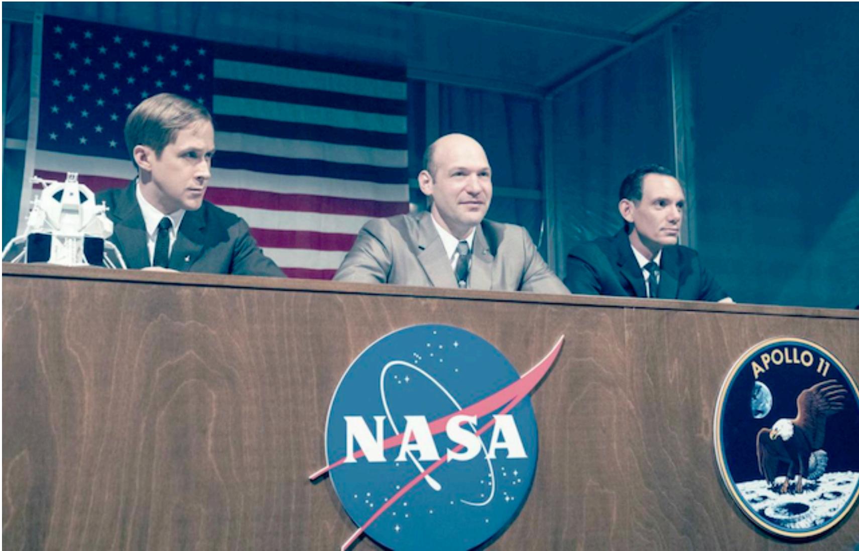
Apollo 11: Armstrong is Joined by Buzz Aldrin (Corey Stoll) and Michael Collins (Lukas Haas) in 'First Man'