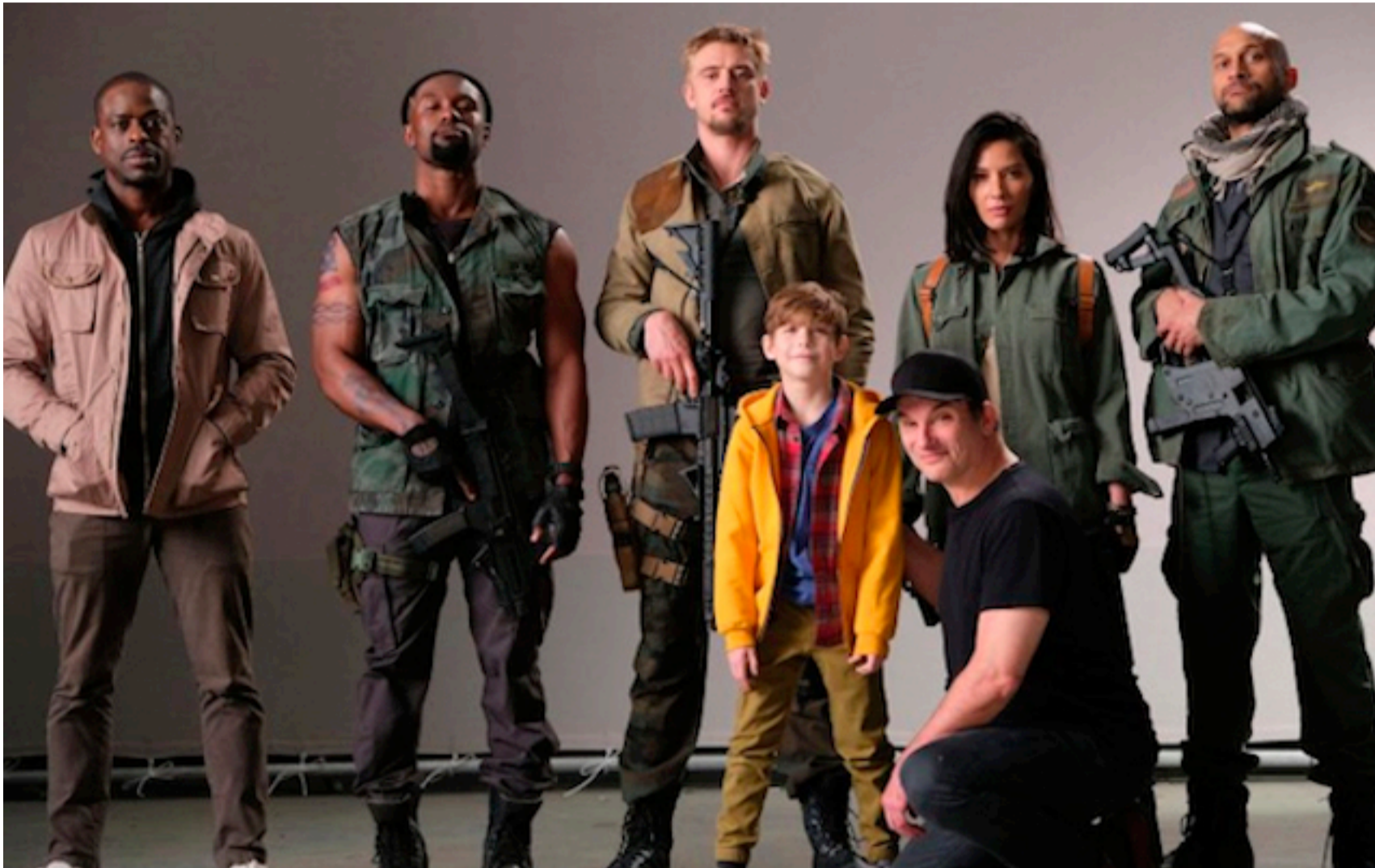
The Cast of ‘The Predator’ Poses with Director Shane Black (kneeling)

It’s not a bad idea to overload a Predator movie with enough wall-to-wall bangs, booms, and bombs, but this time around it comes at the expense of any actual suspense. And while there are new bigger and smarter Predators in this story, they don’t really have any new tricks. Additionally, there are narrative holes big enough to fly a whole fleet of Predator ships through, which doesn’t help. If this film were more of a check-your-brain-at-the-door-fun-fest that wouldn’t matter as much, but it’s not.