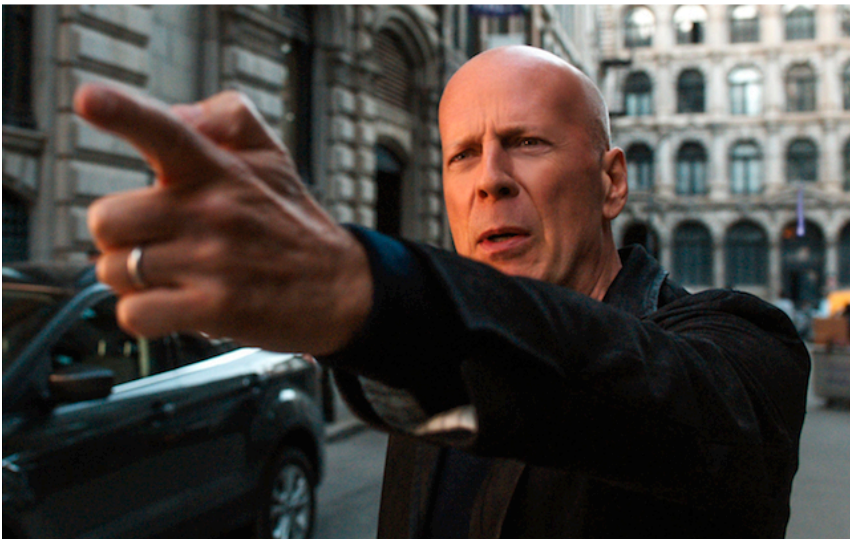
Bang Bang: Dr. Paul (Bruce Willis) has a ‘Death Wish’

Dr. Paul Kersey is a Chicago doctor with the type of perfect family that movies love to exploit, the sparkling Lucy (Elisabeth Shue) as the wife going for her PhD, a college bound daughter named Jordan (Camila Morrone), and a ne’er-do-well brother Frank (Vincent D’Onofrio) to provide some local flavor. Everything about Paul’s life is shattered when burglars kill Lucy and puts Jordan into a coma.