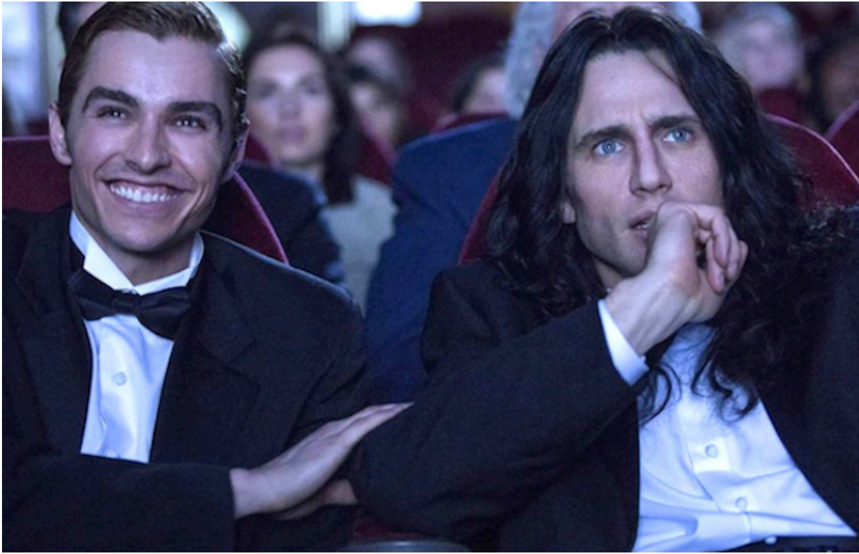
Greg (Dave Franco) and Tommy (James Franco) of 'The Disaster Artist'