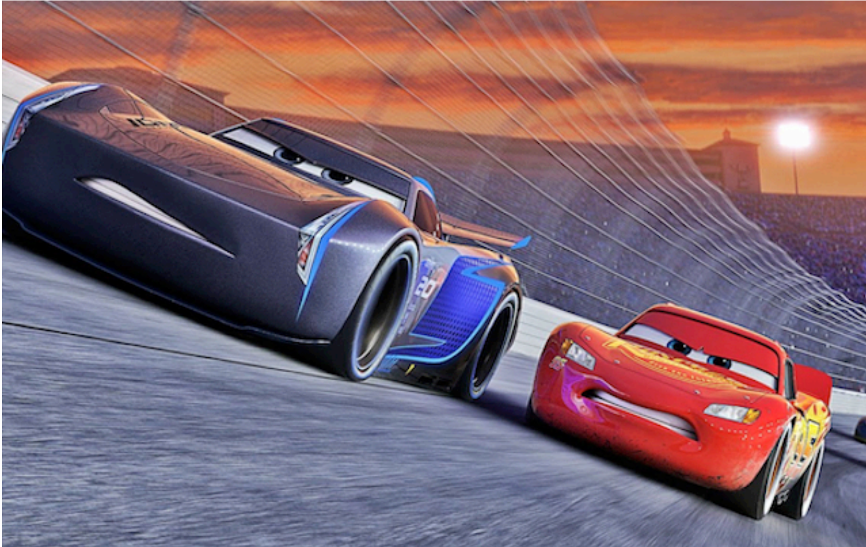
Jackson Storm (Armie Hammer) is Lightning’s Rival in ‘Cars 3’

At this point the film starts to resemble “Rocky IV” – of all things – with the technologically advanced Jackson Storm training on simulators indoors while McQueen and Ramirez are out dodging tractors during stampedes, evading crazed school buses at demolition derbies, and racing on old deserted dirt tracks and getting their tires dirty.