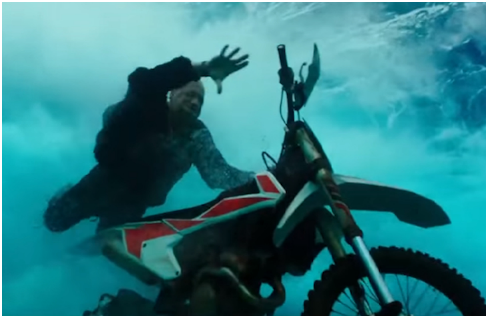
You Will Believe a Man Can Motocross Underwater in 'xXx: Return of Xander Cage'

The cast is eager to please, and it’s one of diversity and internationalism (Thanks, Obama). Toni Collette – who has graduated from art movie performances – oddly has one expression the entire movie (perhaps a message to her agent?), but her presence in the story is perfectly welcomed, and there is hope she will be back. The bad ass Xander team is fun, even though the Scotsman’s power seems to be just wrecking cars, and the Asian guy is simply a good DJ. At least Ruby Rose can “Oswald” a sniper rifle.