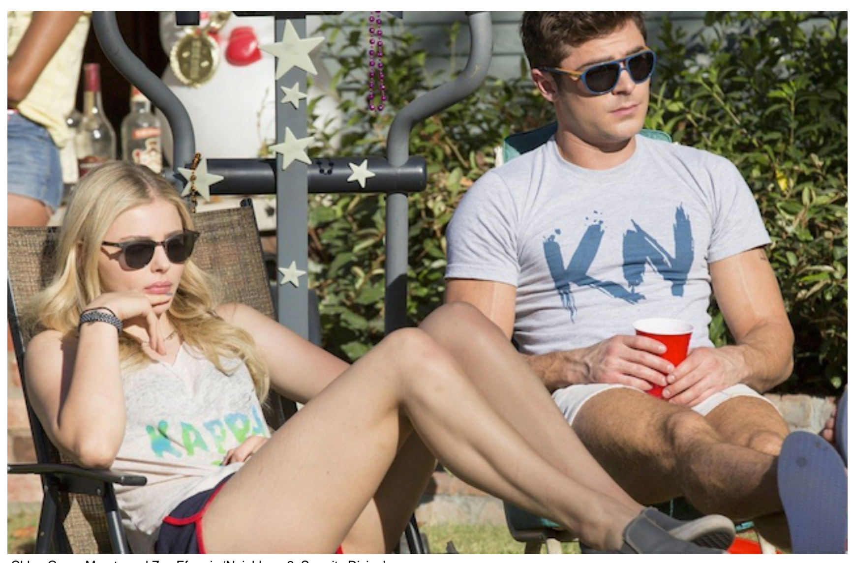
Chloe Grace Moretz and Zac Efron in 'Neighbors 2: Sorority Rising'

There are gross out gags, weed gags, sex toy gags, and the usual college party gags, but the biggest set pieces don't necessarily produce the biggest laughs. Rogen, one of five credited screenwriters, manages to squeeze humor out of throw away lines – plus he has such an easy and winning chemistry with Rose Byrne that they're charming, even while recounting parenting mistakes during an argument about who's more unfit to raise a child.