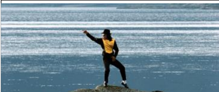
Diego Luna as Michael Jackson in “Mister Lonely,” which is directed by

In a separate story, a priest is bringing food to nearby villagers via airplane. While tossing out rice bags, a nun accidentally falls out of the fuselage. She plummets several thousand feet to Earth and lands unscathed. This causes a stir in the nun’s order and soon her fellow sisters are free falling for the lord.