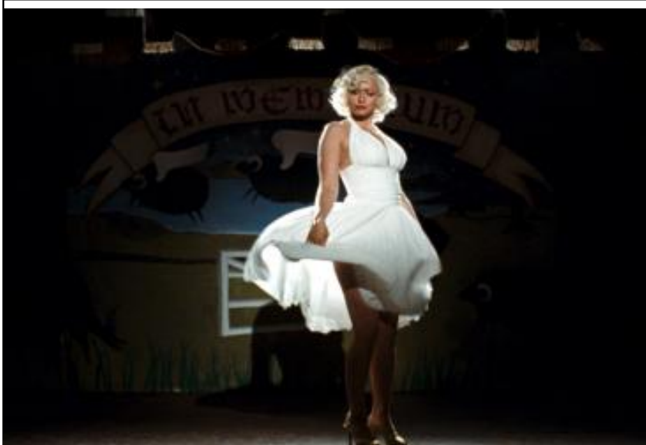
Samantha Morton as Marilyn Monroe in “Mister Lonely,” which is directed by Harmony Korine.

CHICAGO – The wonder of a filmmaker’s art and perspective is the ability to challenge and reflect the absurdity of our own nature back to us. Few filmmakers have done more to add provocation to that sensibility than Harmony Korine.