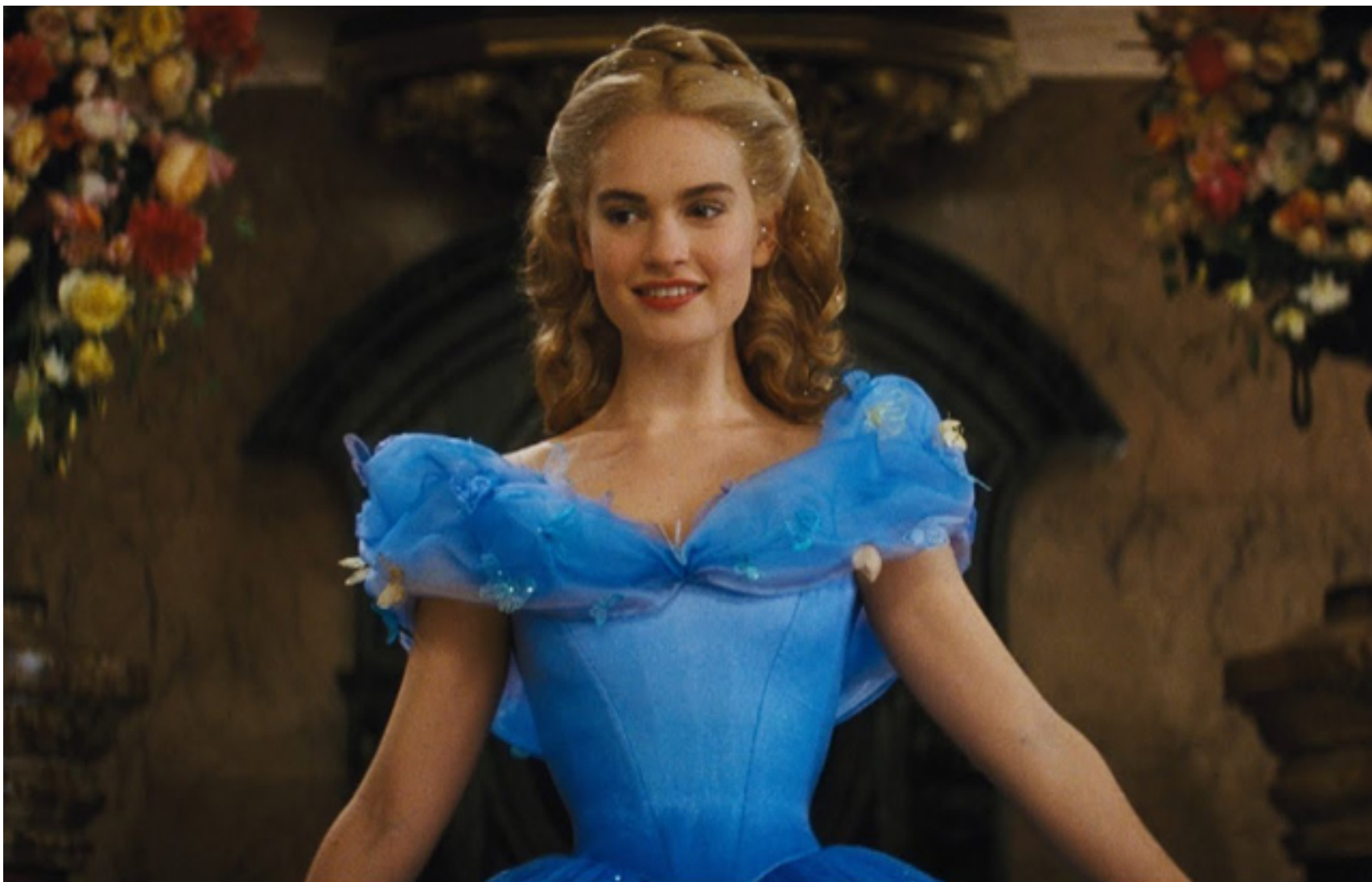
Lily James as the Title Character in ‘Cinderella’

There’s just enough overblown CGI special effects to keep young audiences entertained, especially once the fairy godmother (Helena Bonham Carter) shows up, but not so much that they overshadow the story at the center of things. This is a straight-forward adaptation of the classic fairy tale that treats it as more than just kids stuff. It’s undoubtedly for kids, but director Kenneth Branagh and screenwriter Chris Weitz highlight the sort of aristocratic skirmishes you might find on Downton Abbey – and they’ve raided the prestigious British drama for some of its cast too.