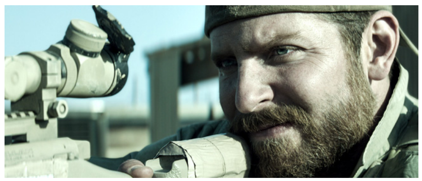
Bradley Cooper as Chris Kyle in "American Sniper".

None of that was true [19] and Eastwood ignored it in the film. Documentaries have a responsibility to be honest and objective. Why doesn't this action/drama film? Kyle would still be seen as a hero even if Eastwood honestly and ethically exposed Kyle's lies. Instead, the film loses credibility for being a true story that is only a half truth.