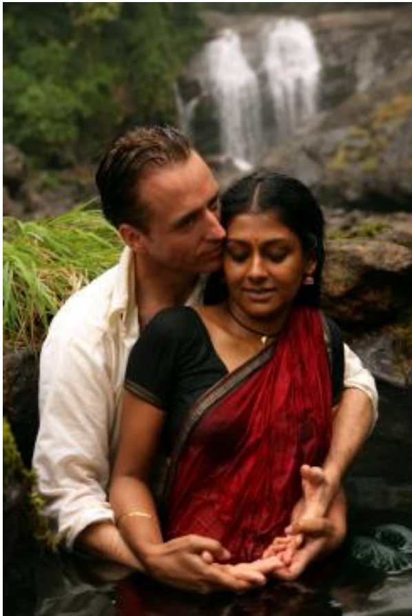
Linus Roache (left) and Nandita Das in "Before the Rains".