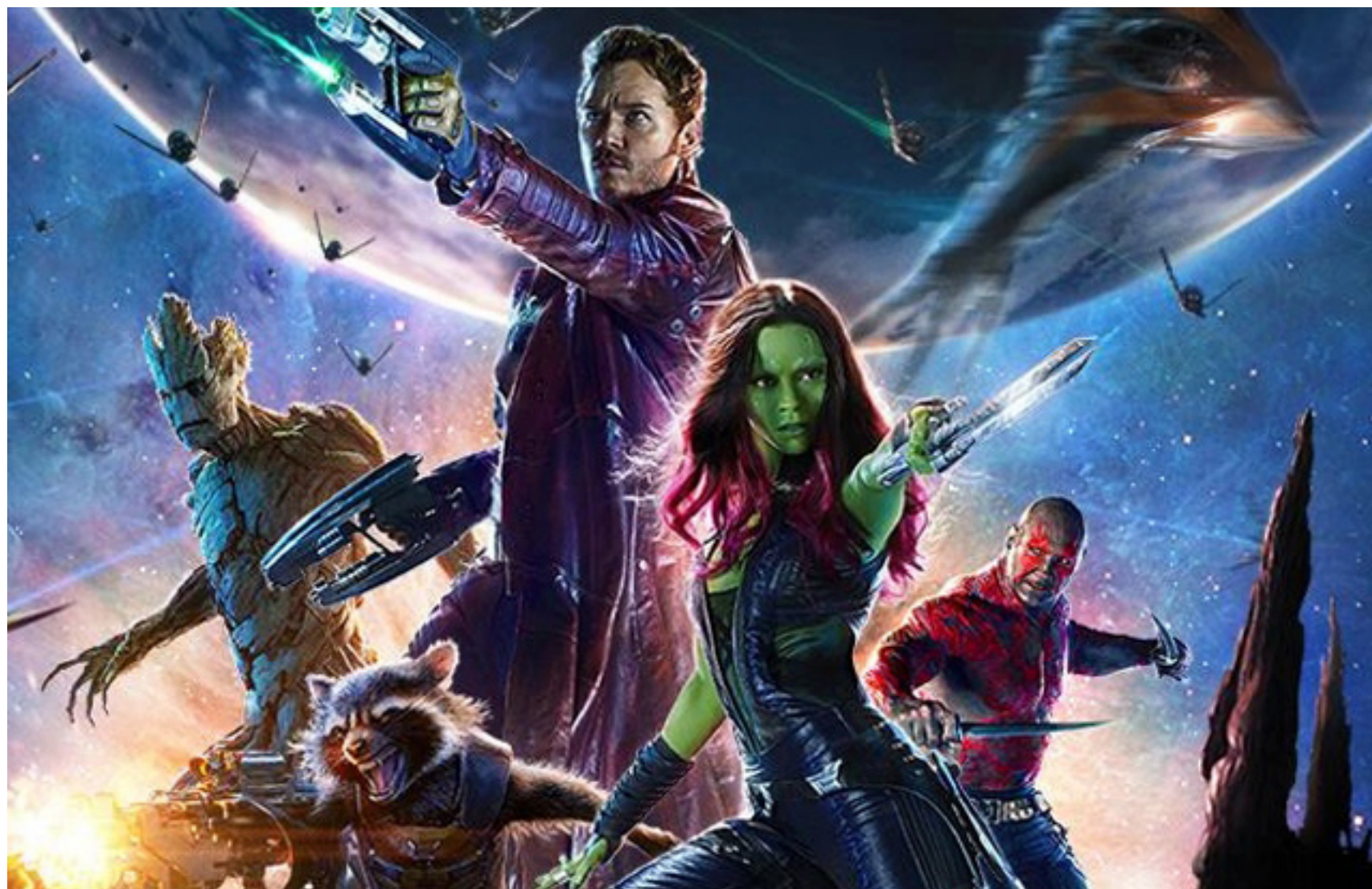
The Team of Warriors in ‘Guardians of the Galaxy’

It’s also a movie that seems created specifically for only the most obsessive of fanboys. It is so in love with its own in-jokes it risks turning off those who aren’t familiar with the characters in the first place. And with a comic this obscure, that’s nearly everyone.