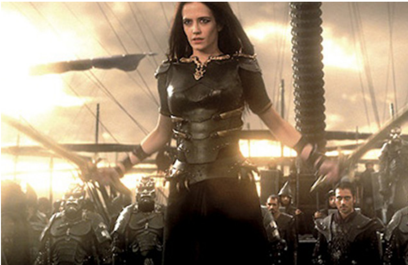
Artemisia (Eva Green) Wants a Piece of the Action in ‘300: Rise of an Empire’

The rest of the cast follows her lead, and are able to deliver the various speeches of inspiration before battle, and then the subsequent battle cries. Australian actor Sullivan Stapleton takes on the Gerard Butler role as leader from the previous film, and is appropriately earnest. Rodrigo Santoro transforms to demigod early in the film as Xerxes, with a baptismal metamorphosis assisted by hermits, caves glowing pools, and unfortunately no payoff.