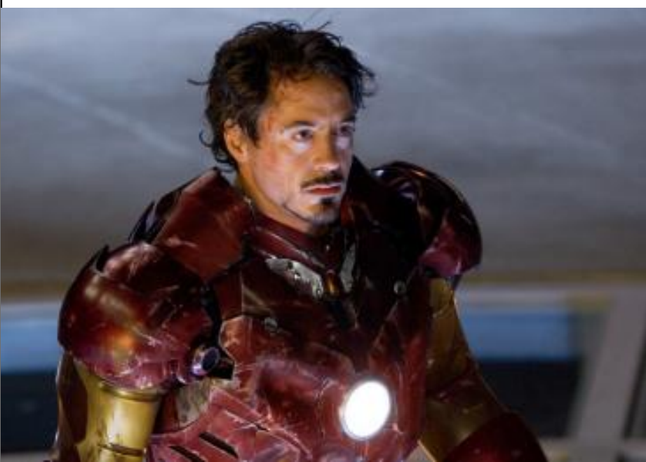
Tony Stark (Robert Downey Jr.) in his battle-scarred Mark III armor in “Iron Man”.

You can’t buy his progression from “do what it takes to get the job done and stuff our pockets fat with cash” guy to “I instigated a mutiny against you in your own company” guy to “I am Iron Monger and I crafted a bigger, badder suit to pound you”.