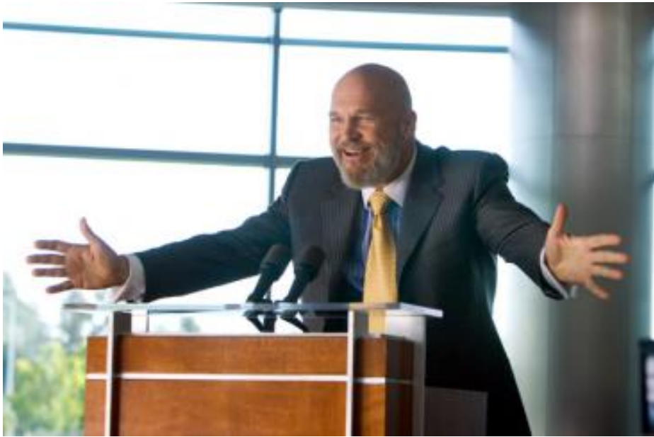
Jeff Bridges as Obadiah Stane in “Iron Man”.

The Chicago-born Terrence Howard as Jim Rhodes – a friend to Stark and sometimes even his unknowing enemy – plays his typical supporting role. Only have we seen Howard as a co-lead in the Warner Bros. flop “The Brave One” (opposite Jodie Foster).