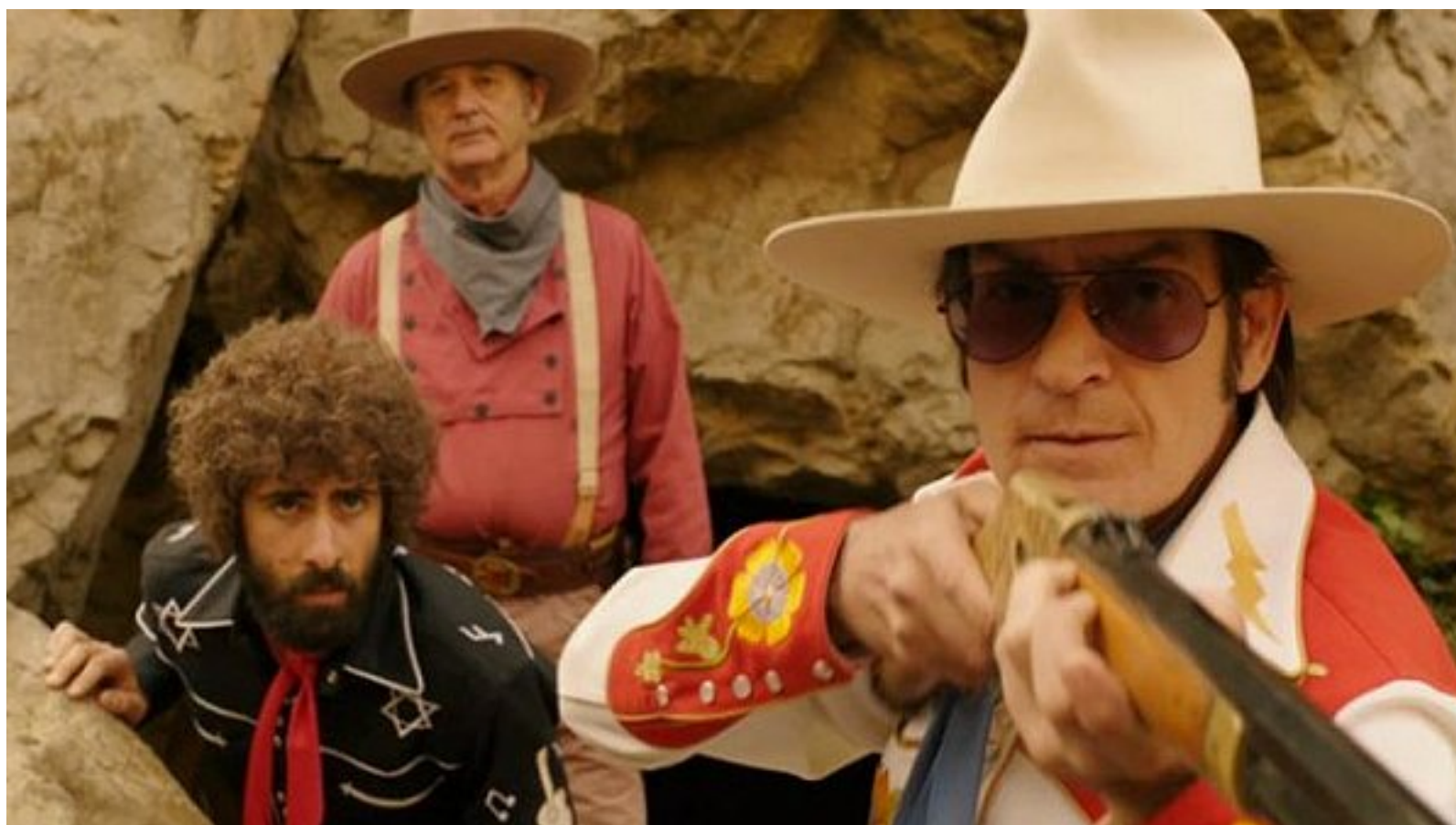
A Glimpse Inside the Mind of Charles Swan III

Charles Swan III does not coincidentally have the same initials as the man who plays this troubled character, who we meet after a break-up with the lovely Ivana (Katheryn Winnick) sends him into an existential and intoxicant-filled tailspin. We wander through this egotist’s hallucinations (in one, he wins an award for Best Bullshit, and, in another, he is dressed a cowboy and shot through the heart by a tricky Indian maid) as the people around him hope he gets his shit together and doctors are concerned about his health. Then he really goes off the edge. Jason Schwartzman stars as his best friend Kirby Star while Bill Murray, Patricia Arquette, Aubrey Plaza, Dermot Mulroney, Stephen Dorff, and Mary Elizabeth Winstead fill out a talented ensemble.